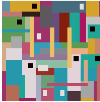
Fig 1 Digital (personal) reproduction of a typical Mondrian tableau used by Land and McCann for their color matching experiments.

In spite of their innovative and important experimental achievements, neither Land nor McCann ‘carved their model into stone’ through a rigorous mathematical formulation and this generated confusion, both about the role of the operations involved in the lightness computation, and in the essence of their model.