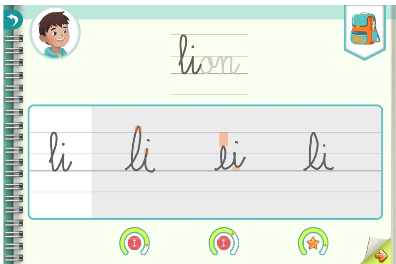
Figure 2: Three trials and their feedback for the bigram li in the word lion .