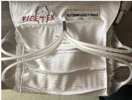
Figure 1. PAGETEX light diffuser support