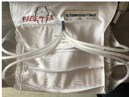
Figure 1. PAGETEX light diffuser support