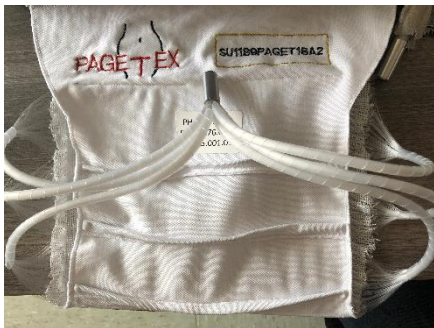
Figure 1. PAGETEX light diffuser support