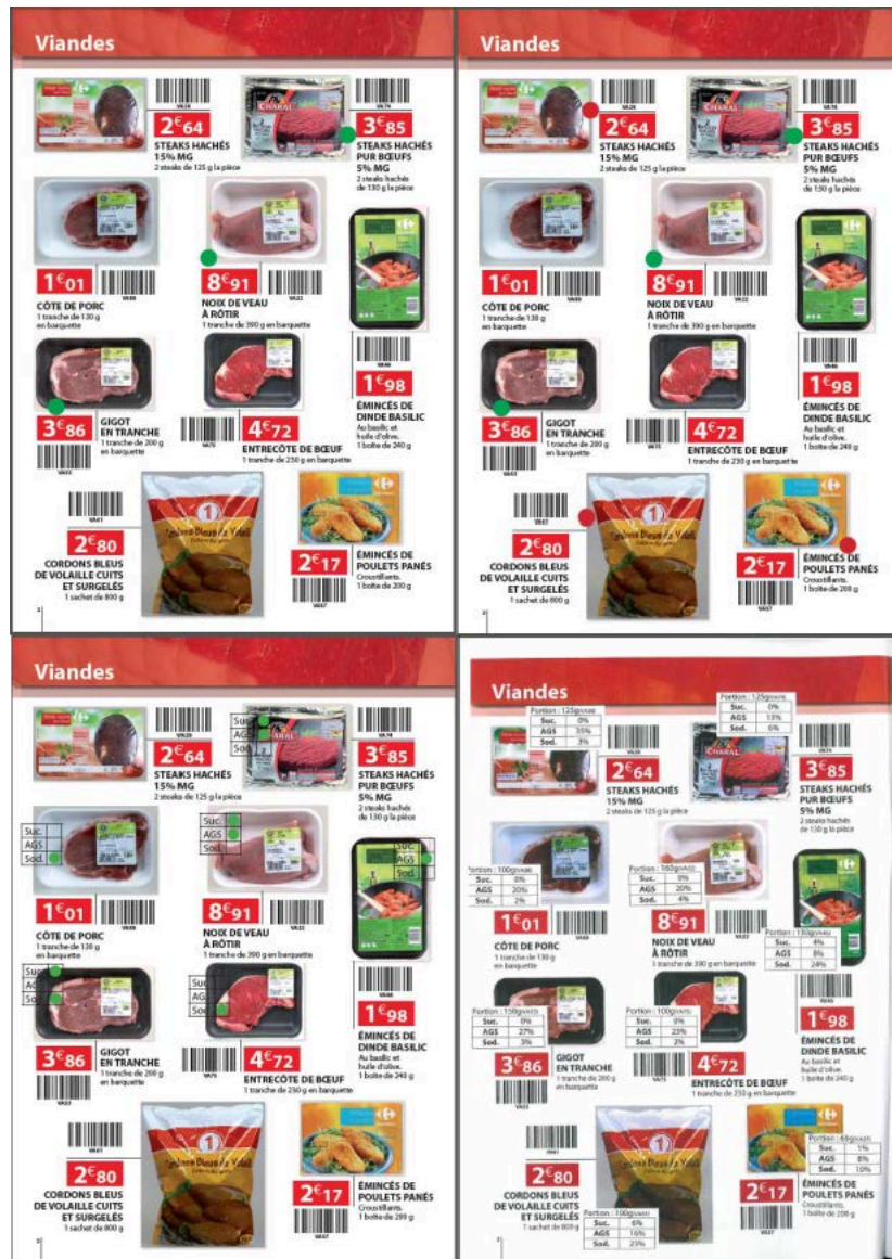
Appendix B. Description of the experimental sample per logo format

Appendix A2. Food catalogues with logos - Example of the meat category with the PCG logo system at the top left, PCT at the top right, NCG at the bottom left and GDA at the bottom right.