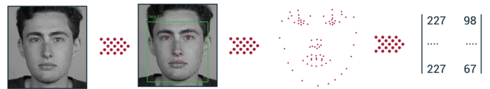
Fig. 4. Facial feature detection