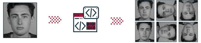
Fig. 3. Data Augmentation