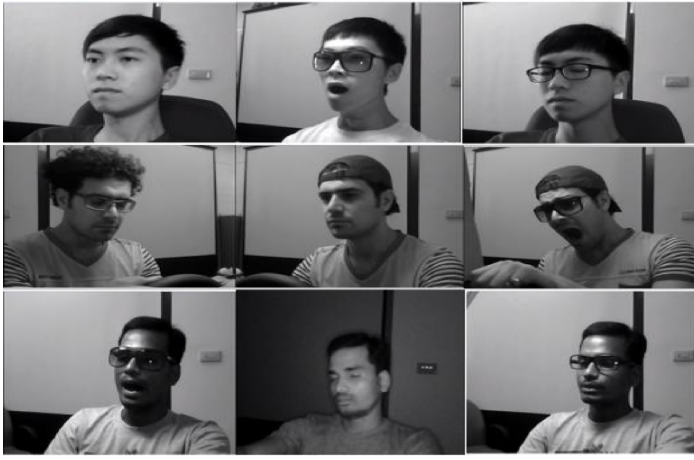
Fig. 1. NTHU Dataset Sample Images