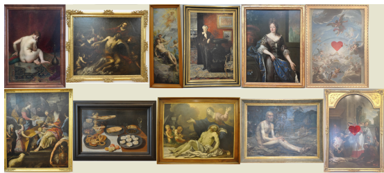
Figure 2: Extract from the mosaic of the paintings from the ground floor.

as well as the rights regarding his or her data. A declaration to the CIL register has been made to ensure that the data comply with the legal framework. He is then equipped with eye-tracking glasses, which are calibrated, and instructed to visit the museum as naturally as possible, as if he was not wearing the glasses. During the visit, the experimenter has access to the video filmed live by the eye-tracker’s scene camera, and can thus quickly intervene in case of a problem. The subject can take as much time as he wants to visit. When the subject has finished his visit, he is invited to answer an online questionnaire on his museum visiting habits, preferences, and feelings about his visit. He also indicates, on a mosaic of the paintings from the ground floor, which takes the form of an Internet page, those he has appreciated (see Figure 2). In order not to solicit visitors too long, we only ask them to express their preferences in the form of likes (a click on the painting is equivalent to a click on a like button).