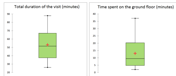
Figure 3: On the left boxplot of the time spent visiting the whole museum and on the right boxplot for the ground floor.

part, museums a few times a year, or even once or several times a month for a third of the subjects. We collected, with the help of the videos of the scene cameras, for each participant, the duration of their visit, and the time spent on the ground floor (see Figure 3), i.e. the duration of the study strictly speaking since we did not analyze the data collected when the subjects were in the floors. Of the 16 subjects, we only selected 13 visitors who spent time looking at the artworks on the ground floor.