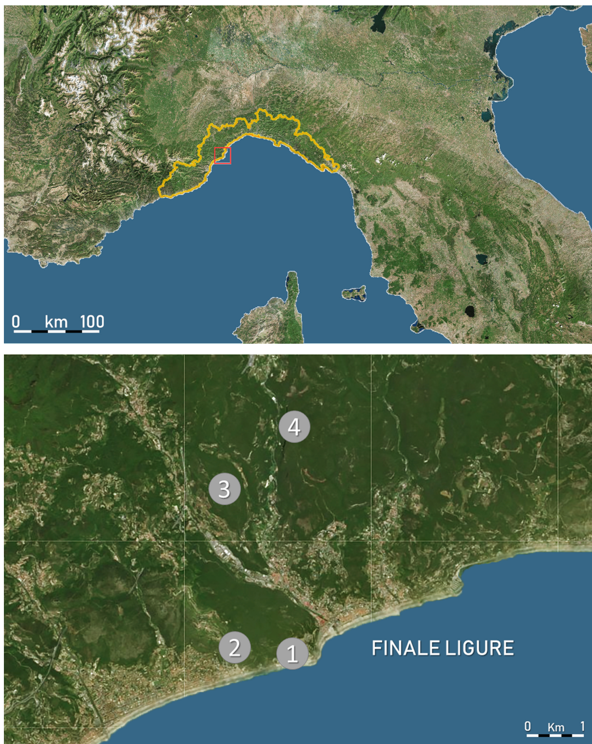
Fig. 1. Geographical location of the sites included in this study. Top: the Finalese area within the Liguria region in northwestern Italy. Bottom: the sites in the municipality of Finale Ligure: 1) Arene Candide Cave; 2) Arma dei Parmorari; 3) Arma delle Anime; 4) Arma dell'Aquila.

(e.g. Drucker et al., 2018; Goude et al., 2018; Jovanović et al., 2019). While bone biogeochemical composition provides general information covering the time of its formation and renewal (last years of life, depending on age and physiology; e.g. Szulc et al., 2000; Hedges et al., 2007), teeth, and more particularly sequential analysis of teeth, provide more detailed biogeochemical information regarding the moment of dentine formation (i.e. from prenatal to early adulthood; Alqahtani