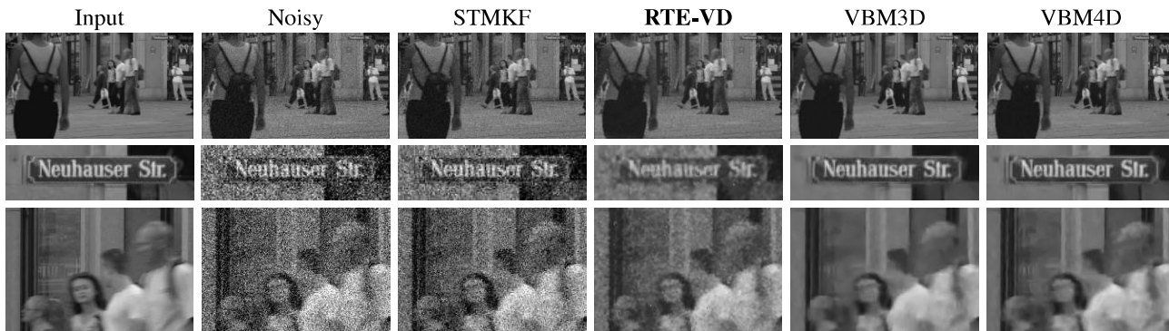
Figure 1. Visual comparison on the pedestrians sequence with a standard deviation noise of 40 (PSNR in Tab.1)

In this paper we present a new Real-Time Embedded Video Denoising (RTE-VD) algorithm in section 2. Then, we compare our method with other state-of-the-art algorithms in terms of denoising efficiency in section 3. We then present the main optimizations made to achieve real-time performances in section 4. In section 5, we compare RTE-VD with other state of the art methods in terms of computation speed and we also provide a time versus energy consumption study for various embedded platforms. Finally, we introduce our embedded video denoiser prototype called VIRTANS in section 6.