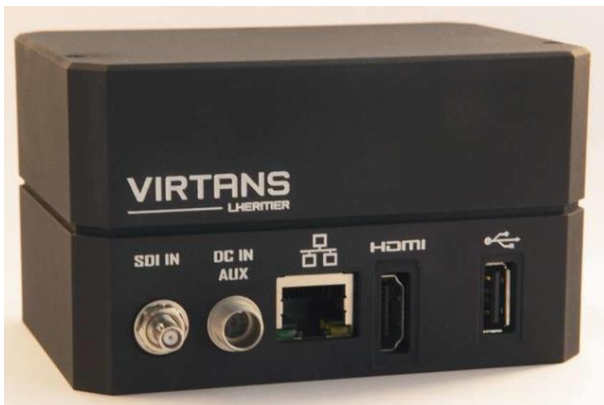
Figure 4 Current prototype of the VIRTANS platform

In this section we introduce the VIRTANS family and its first born: the VIRTANS. VIRTANS stands for Video Real-Time Algorithm and NS for Noise Suppression. VIRTANS aims to provide a new embedded platform to perform heavy real-time video processing algorithms. It is currently in its early development stage and the first algorithm to be deployed on, is RTE-VD. With RTE-VD, VIRTANS becomes VIRTANS. It is based on the industrial version of the TX2 architecture and comes in a pretty small form factor (cf Fig. 4).