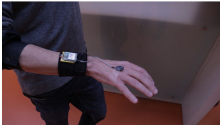
Sidebar 2: RIoT sensor with a detached IMU sensor.