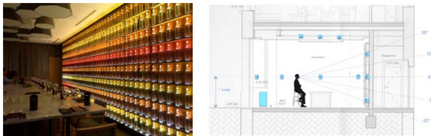
Fig. 1. Krug tasting room (Reims) equipped with a 32-loudspeaker system (right), and the “400 wines wall” representing the 400 ‘vins clairs’ held in the Krug wine library (left)

To do that, we worked in collaboration with members of the Krug winemaking team (Eric Lebel, the Cellar Master or Chef de Caves , and Alice Tetienne, Winemaker ) and a music composer (Roque Rivas). Moreover, the project aimed at being implemented in a dedicated room – La Salle des 400 vins – where a specific multi-channel sound diffusion system has been designed and installed in order to render spatial properties of the sound production (see Fig. 1 and Sec. 4.2 for details).