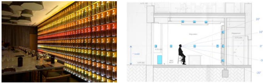
Fig. 1. Krug tasting room (Reims) equipped with a 32-loudspeaker system (right), and the “400 wines wall” representing the 400 ‘vins clairs’ held in the Krug wine library (left)

To do that, we worked in collaboration with members of the Krug winemaking team (Eric Lebel, the Cellar Master or Chef de Caves , and Alice Tétienne, Winemaker ) and a music composer (Roque Rivas). Moreover, the project aimed at being implemented in a dedicated room – La Salle des 400 vins – where a specific multi-channel sound diffusion system has been designed and installed in order to render spatial properties of the sound production (see Fig. 1 and Sec. 4.2 for details).