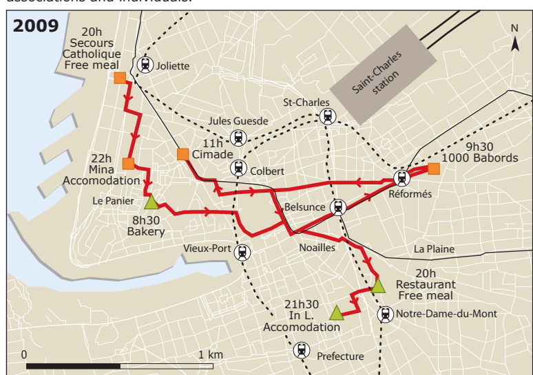
Setting phase : renting a flat, getting a contract of employment, family entry and settlement.

Arrival phase, first 8 months: house-hunting, trying to get papers, refusal of the application for asylum, appeal to the CDNA, learning French, help from associations and individuals.