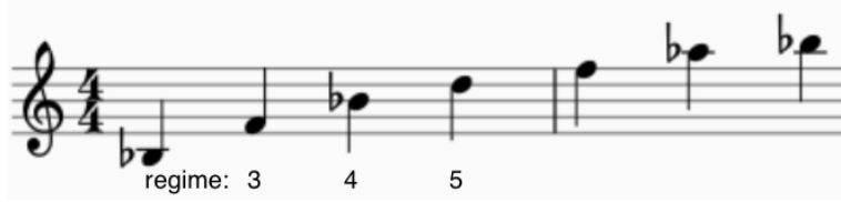
Figure 2: different regimes of a Bb trumpet (concert-pitch), with regime 3 (F4), regime 4 (Bb4), and regime 5 (D5)