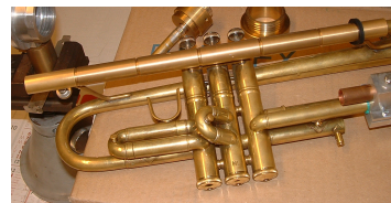
Figure 1: design of the parameterised leadpipe

Several parts 1-2-3-4, with various values for the radii r_1, r_2, r_3, r_4 , have been manufactured with a numerically controlled turning machine. The proposed values of r_1, r_2, r_3, r_4 correspond roughly to dimensions of marketed leadpipes, and the assembling of the parts can generate many hundreds of different inner leadpipe profiles. A naming system has been defined to distinguish every leadpipe. The leadpipes are named after a 4 letters code, each letter corresponding to the radii dimension of the corresponding part. So, using the same trumpet ( Bach , bell 43, see figure 1) and the parameterised leadpipe, several hundred different instruments with notably different acoustical behaviour can be designed [7]. Two leadpipes ( AAAE and CHMQ ) were studied, whose characteristics are presented in table 1.