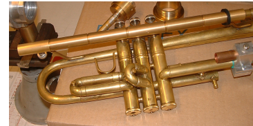
Figure 1: design of the parameterised leadpipe

Several parts 1-2-3-4, with various values for the radii r_1 , r_2 , r_3 , r_4 , have been manufactured with a numerically controlled turning machine. The proposed values of r_1 , r_2 , r_3 , r_4 correspond roughly to dimensions of marketed leadpipes, and the assembling of the parts can generate many hundreds of different inner leadpipe profiles. A naming system has been defined to distinguish every leadpipe. The leadpipes are named after a 4 letters code, each letter corresponding to the radii dimension of the corresponding part. So, using the same trumpet ( Bach , bell 43, see figure 1) and the parameterised leadpipe, several hundred different instruments with notably different acoustical behaviour can be designed [7]. Two leadpipes ( AAAE and CHMQ ) were studied, whose characteristics are presented in table 1.