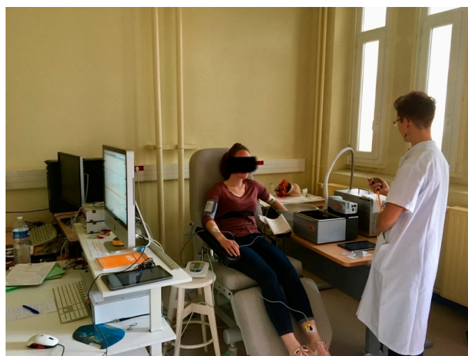
Figure 3. Clinical trial set-up during a CPT test.

The final set-up is illustrated in Figure 3. Monitoring was conducted through the computer to the left. Patients had to their right the CPT tank as well as the warm water if needed. Investigators were wearing lab coats over casual clothing.