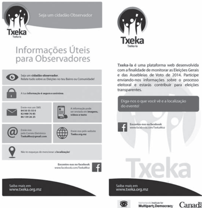
[Image 1: Steps and instructions for observers to interact and send information – mobile numbers, voice, SMS, e-mail and website]