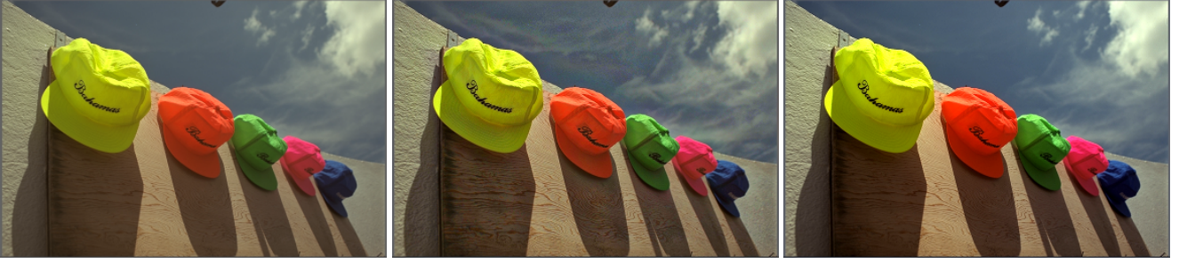
Fig. 1 Different activations and kernels imply the processing of different features. Left: Original image - Middle: Solution of the model (9) (non-linear activation) with the kernel w_{hor} taken as a constant kernel of medium-size support - Right: Solution of the model (11) (linear activation) with the kernel w_{hor} taken as a Gaussian kernel of large variance.