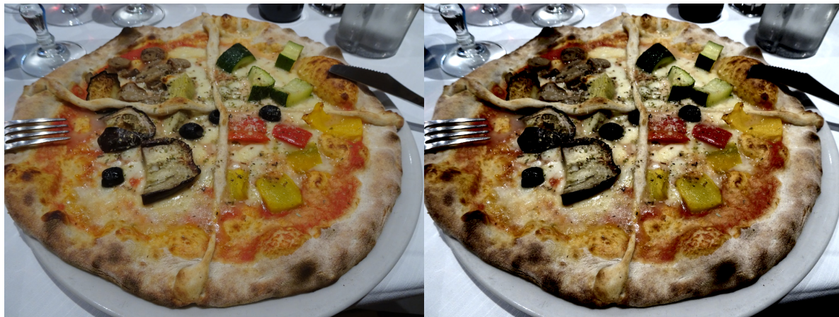
(e) Input image