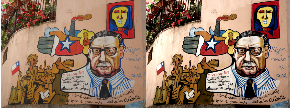
(a) Input image