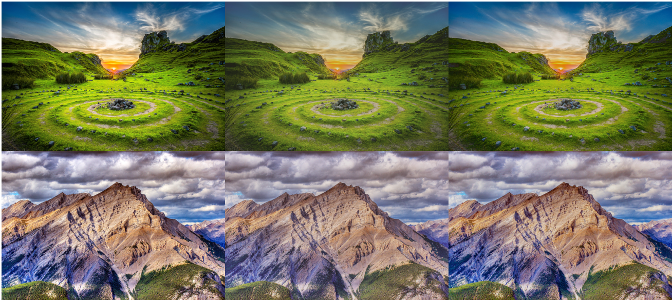
Fig. 4 Contrast reduction of tone-mapped high dynamic range images. Left: output of a tone-mapping method. Center: Contrast reduction model (17) induced by the connection 1-form vanishing in the L^*a^*b^* frame. Right: Contrast reduction model (17) induced by the “perceptual” connection 1-form described in sect. 4.2.1.