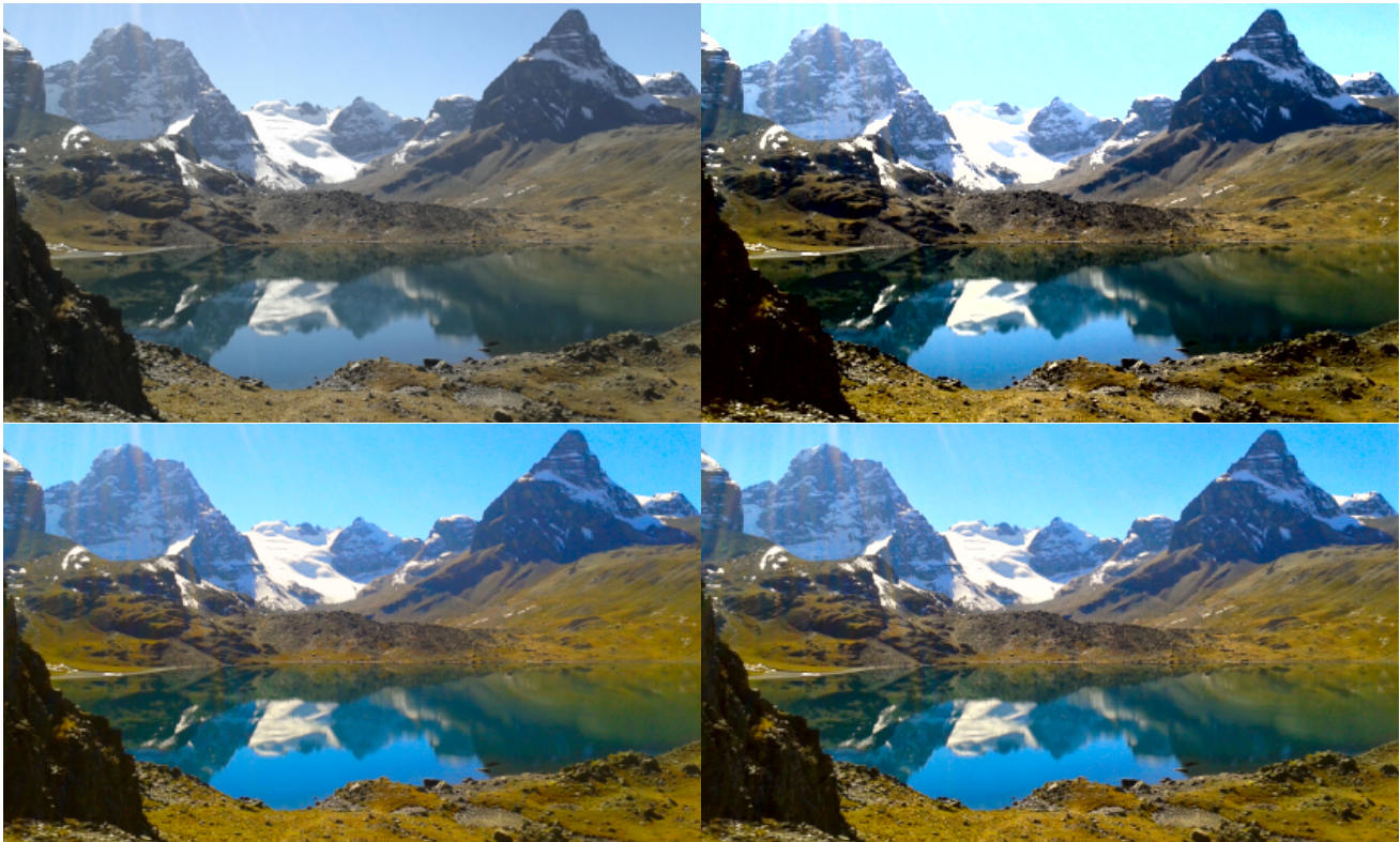
Fig. 2 Landscape photographies enhancement with the models (17) and (20). Top-left: image obtained with a standard camera. Top-right: Enhancement of the contrast of both the chromatic and achromatic components of the top-left image (model (17)). Bottom-left: Enhancement of the contrast of the chromatic components of the top-left image (model (20)). Bottom-right: Enhancement of the contrast of the chromatic components and the local features of the achromatic component of the top-left image (model (20)).

(17) consists in processing the norm r_0 of a_0