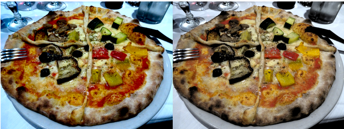
(g) Channelwise method