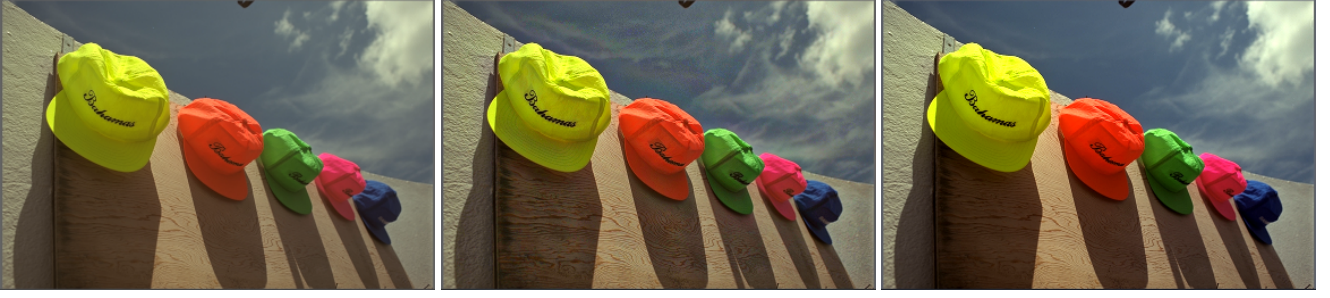
Fig. 1 Different activations and kernels imply the processing of different features. Left: Original image - Middle: Solution of the model (9) (non-linear activation) with the kernel w_{hor} taken as a constant kernel of medium-size support - Right: Solution of the model (11) (linear activation) with the kernel w_{hor} taken as a Gaussian kernel of large variance.