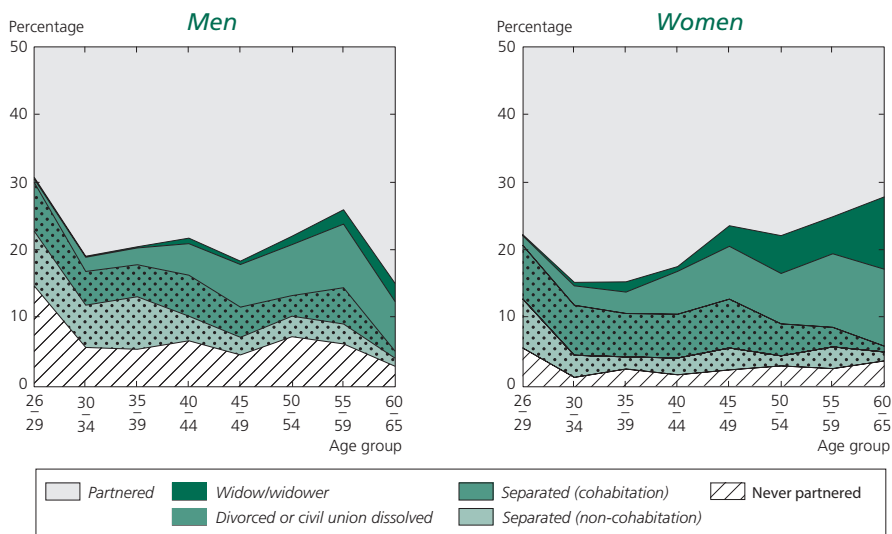
Figure 1. Rates and types of singlehood by age group and sex (%)

Coverage: Individuals aged 26 to 65 living in metropolitan France.