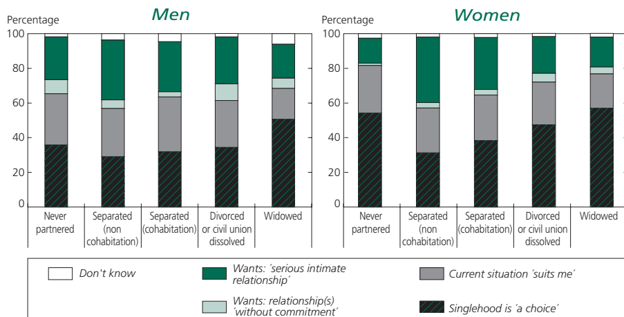
Figure 2. Unpartnered people’s attitudes towards of singlehood by sex and partnership experience

Question: ‘Regarding singlehood: (1) It’s my choice; (2) It’s not really a choice, but the situation suits me; (3) I would like to have a serious intimate relationship; (4) I would like to have a relationship, or more than one, without committing myself’.