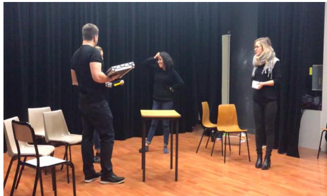
Photo 4. The performance phase. This photo illustrates students playing a scene from Ourselves Alone .

After more warm-up, cohesion and preparatory activities in the last two courses, the students had to play scenes from both acts of the play (photo 4).