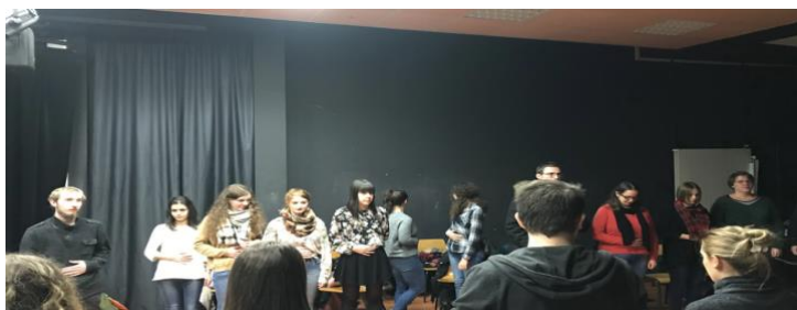
Photo 2. Breathing exercises. This photo illustrates how to concentrate through breathing exercises.

The students discovered the preparation phase through lessons 1 to 4. After a course on the geographical situation and history of Northern Ireland, we started to create a class ritual with breathing exercises so as to help students concentrate and create a relaxing atmosphere (photo 2), and warm-up activities linked to voice training (such as tongue-twisters) and cohesion activities.