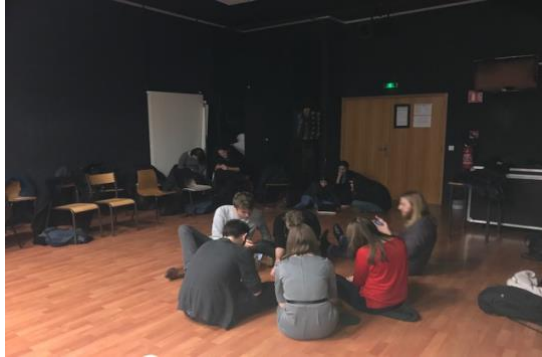
Photo 3. Analysing one theme from a play. This photo illustrates how students managed to occupy the whole unusual space in groups.

(characters, place, time, props, stage directions) before giving oral presentations in groups in front of the class. The teams had to get used to the new space (which was not a traditional classroom) and occupy it all as can be seen in photo 3.