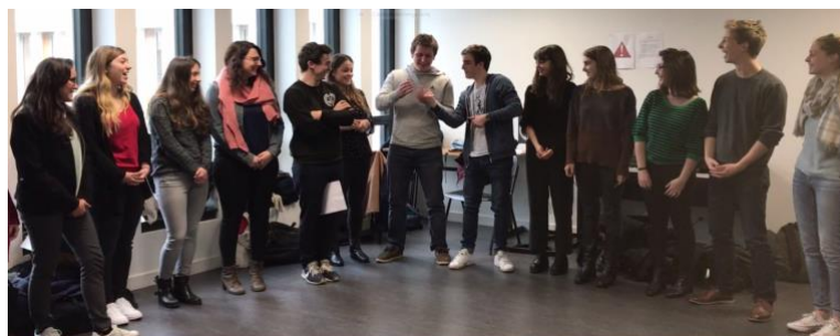
Photo 1. Cohesion activity, passing on the objects. This photo illustrates how to ease the atmosphere.

The course started with warm-up exercises so as to wake the students' bodies and vocal cords up. After a first series of exercises (walking, stretching and preparing their voices), the students had to engage in cohesion activities. One example of the cohesion activities is given in photograph 1. For this activity, they had to think about the product they had to advertise and pass it along from one student to the next. The product necessarily changed aspects, weights, sizes, which gave rise to a lot of funny transmissions – as the smiles on the students' faces can be seen in photo 1 – and created a relaxed atmosphere.