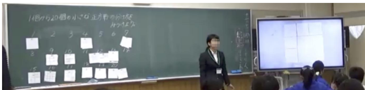
Figure 3: The blackboard and the large display in a Japanese classroom.

One obvious factor that supports, or even requires to carry out, the collective teaching in Japanese class is the number of pupils. In the classroom of 35 pupils (about 20 pupils in Swiss case), it is difficult for the teacher to take care of them one by one individually. The whole class validation in the neriage phase is a solution for this constraint. In addition, the Japanese classroom is equipped so that the teacher can control the whole class: the blackboard in front in addition to the large display at the side (see Figure 3). These are the conditions or constraints that afford or hinder collective teaching at the school level in terms of the codetermination.