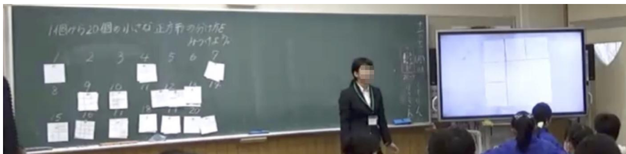
Figure 3: The blackboard and the large display in a Japanese classroom.

One obvious factor that supports, or even requires to carry out, the collective teaching in Japanese class is the number of pupils. In the classroom of 35 pupils (about 20 pupils in Swiss case), it is difficult for the teacher to take care of them one by one individually. The whole class validation in the neriage phase is a solution for this constraint. In addition, the Japanese classroom is equipped so that the teacher can control the whole class: the blackboard in front in addition to the large display at the side (see Figure 3). These are the conditions or constraints that afford or hinder collective teaching at the school level in terms of the codetermination.