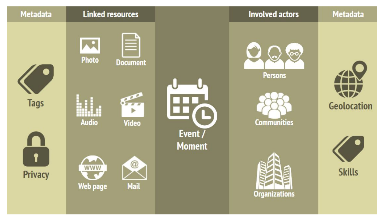
Fig. 2. The "event" object of the Re-Source Ontology linked to contacts

Events are complex objects that allow the users to aggregate a large amount of information to document a project. They can represent trivial things like sending an email or more complex things like visiting an artist studio, attending a seminar... It is possible to associate with an event additional information such as, for example, media resources (text, documents, photos, videos,...), contacts of any kind (people met, artists, companies,...), "Concepts" from the Skos thesaurus, geographical information, memos (see next paragraph explaining the semantic annotation), etc... The "event" representation is an essential object of the Re-Source model because the more information on contacts, actors, resources and concepts are associated for describing the events, the richer is the Re-Source archive, that can finally return new interesting relationships among artworks.