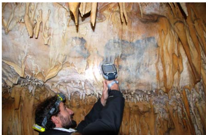
Figure 1 XRF measurement in Villars Cave (Dordogne, France) on the horse called Le petit cheval bleu in the Salle des Peintures (Painting Room).

The device used in this study is a commercial XRF elemental analyzer (Niton XL3). The system is a single unit, hand-held and battery-powered (Figure 1). It is equipped with a 50-kV miniaturized X-ray tube combined with an X-ray detector. It can detect chemical elements heavier than nickel ( Z > 28 ) in a very short time (within 1 min) and without contact with the wall. Therefore, we can easily measure the content of manganese and iron, the major elements of prehistoric pigments, by detecting the X-ray lines at 5.9 and 6.4 keV, respectively. Carbon is not detected directly, but its presence can be inferred from the absence of the above elements (Mn and Fe).