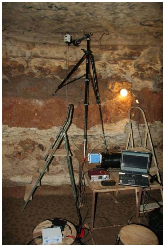
Figure 3 Raman spectrometer in Rouffignac Cave (Dordogne, France), Great Ceiling (Grand Plafond).

Two main locations have been selected to perform the analyses: the Great Ceiling (Grand Plafond) and the Henri Breuil Gallery. The Great Ceiling gathered 65 figures without any striking global organization, whereas the Henri Breuil Gallery with its “ten mammoth frieze” and “rhino frieze” is well structured. Another location presenting 2 “faced mammoths” was also studied. Located a few hundred meters from the Henri Breuil Gallery and the Great Ceiling, these 2 drawings are isolated from the rest of the cave. A total of 10 figures were studied: in the Henri Breuil Gallery, 4 of the 10 mammoths of the frieze forming a stylistically homogeneous group and 1 rhino of the “three rhino frieze”; 3 drawings of the Great Ceiling; and the 2 isolated “faced mammoths.”