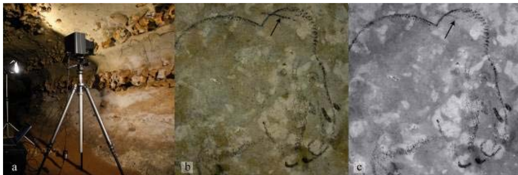
Figure 5 (a) Infrared camera in Rouffignac Cave; photographs (b) with visible light and (c) with infrared of mammoth #66 on the Grand Plafond.

Infrared reflectography (IR) is used in museums to decrypt painting techniques revealing artist corrections and redrawing. Indeed, infrared radiation goes through most of the paint layers except the black lines that are revealed by contrast (van Asperen de Boer 1968). This study presented an opportunity to conduct the first test of an infrared camera in a cave environment. In the Rouffignac and Villars caves, we used an infrared imaging system specially designed for art conservators (OSIRIS-Opus Instruments) (Figure 5a). This camera provides high-resolution and high-speed images of black drawings. Shots were made in the Painting Room (Salle des Peintures) of Villars Cave and on the Great Ceiling (Grand Plafond) of Rouffignac Cave. As an example, a figure representing the mammoth #66 covered by an assumed modern line composed of carbon (confirmed by Raman analyses) is presented in Figure 5b (visible light) and in Figure 5c (IR). While the mammoth drawing and the transversal line both appear dark black in visible light, they present different gray levels in IR photographs. It is thus possible to distinguish the 2 different materials used in this figure to make the black lines: with IR, manganese oxide, which constitutes the animal figure, appears black while the charcoal-based line partially disappears. This first test shows that it is possible by this non-destructive photographic technique to isolate figures or lines made with carbon.