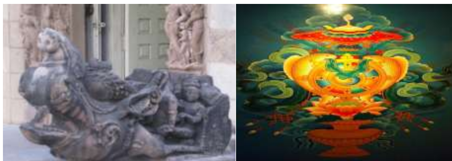
Fish gargoyle in a temple in South India The Golden fishes in a thanangka

It is said that the two fishes are depicted in Buddhist iconography is because fish often swim in pairs. In connection with water, fish also represents creation. Water is an element that creates life, and it is related to the symbiotic fluid in the mother's womb. Two-fish iconography is not only found in Buddhist symbolism, but also in other cultures such as the ceramic bowl at Nazca in Peru. Plaques and ornaments with symbols of two fish are typically offered to newly married couples in China as a symbol of conjugal rights and fidelity. At the philosophical level, fish also represents the balance between thought and emotion for experiencing higher consciousness which enables us to act with more clarity and rationality. When the right/left hemispheres of the brain are unbalanced we are prone to suffer from mood swings and confusion. Feelings of anger, hatred, jealousy and other fear based emotions lead us into making wrong choices. The two-golden fish therefore represent the ability to create the balance between the body and mind to attain what Buddhists call "Nibbana" or Samadhi. In Vedic chronology, matsya (meaning fish) also represents the first stage in the evolution of life. From an esoteric point of view, this is the birth of a new idea that can be developed to create something one wants in life. Two fishes therefore symbolize the ability to create good fortune and prosperity in life and how much one achieves, depends on how balanced one is in body and mind.