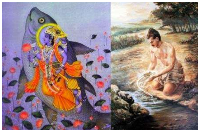
Story of Manu and Matsya Purana

Vedavyasa, the son of Satyavati and the sage Parashara besides composing the Mahabharata also composed the Mahapuranas. His real name was Krishna Dvaipayana. As he was dark in complexion, he was called "Krishna" and as he was born in an island, the sage acquired the name of Dvaipayana, where "dvipa" means an island. The Mahabharata has one lakh shlokas or couplets. After composing the Mahabharata, Vedavyasa composed the eighteen mahapuranas. The Matsya Purana is a medium-length Purana, and consists of fifteen thousand couplets. The longest Purana, the Skanda Purana , has eighty-one thousand. And the shortest Purana, the Markandeya Purana , has only nine thousand. The fourteen thousand shlokas of the Matsya Purana are divided into two hundred and ninety-one chapters (adhyaya). Usually Vishnu is regarded as having had nine incarnations, with the impending tenth one, Kalki, in the future.