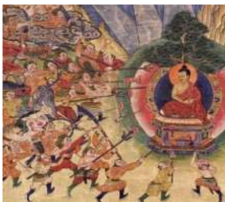
Temptations of Mara

Maras, not very different in appearance from a naga and somewhere between the dragon and the snake is a mythical creature which the Pali dictionary introduces as "the personification of Death, the Evil One, the Tempter (the Buddhist counterpart of the Devil or Principle of Destruction)." The commentary further states that "The legends concerning Mara are ... very involved and defy any attempts at unraveling them." My reason for including Mara in this discussion is because metaphorically Mara belongs to the libidinal sea of desires and the dark deconstructive forces which find alliance with Satan leading Eve to the forbidden fruit. Maras also depict the negative Kundalini energy in our spine. While the meditative practices force the kundalini energy through the "sushumna" or the spine to uncoil and move upwards to spread its hood of enlightenment in "sahasara", the negative kundalini coils to wreck disease, lust, anger and negativity, as attributed to demoniac Mara.