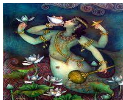
The Sacred Conch