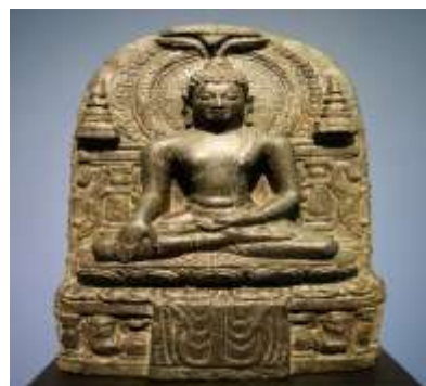
Akshobhaya statue in Bihar

Mara with time goes through a process of abstraction, so much so that the bhumi-sparsa-mudra becomes a short-hand way of recalling the event of great departure. The additional element of the Temptation by Mara's daughters is sometimes portrayed discreetly on the pedestal with three dancing girls and two playing musical instruments in some Buddhist architecture. Say for example in Nalanda sculpture, three female figures on the pedestal, possibly suggest the association of Mara as a yaksa or demon. But the three female figures do not appear in all cases. The Buddha statue in the earth-touching posture in the case of a Buddhist sculpture in Bihar of the 8th or 9th century, becomes identified as one of the Dhyani Buddhas of the Mahayana tradition with the specific name of Aksobhya, meaning the imperturbable one.