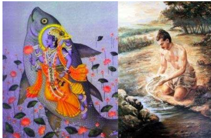
Story of Manu and Matsya Purana

Vedavyasa, the son of Satyawati and the sage Parashara besides composing the Mahabharata also composed the Mahapuranas. His real name was Krishna Dvaipayana. As he was dark in complexion, he was called "Krishna" and as he was born in an island, the sage acquired the name of Dvaipayana, where "dvipa" means an island. The Mahabharata has one lakh shlokas or couplets. After composing the Mahabharata, Vedavyasa composed the eighteen mahapuranas. The Matsya Purana is a medium-length Purana, and consists of fifteen thousand couplets. The longest Purana, the Skanda Purana , has eighty-one thousand. And the shortest Purana, the Markandeya Purana , has only nine thousand. The fourteen thousand shlokas of the Matsya Purana are divided into two hundred and ninety-one chapters (adhyaya). Usually Vishnu is regarded as having had nine incarnations, with the impending tenth one, Kalki, in the future.