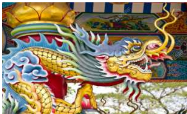
Mara in a Buddhist Monastery pillar

Nagas are mythical serpents which find strong representation in all religions and cultures. In Buddhism, they often are protectors of the Buddha and of the dharma. However, they also are worldly and temperamental creatures that spread disease and misfortune when angered. The word naga means "cobra" in Sanskrit.