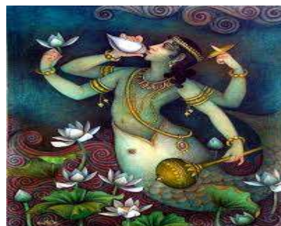
The Sacred Conch