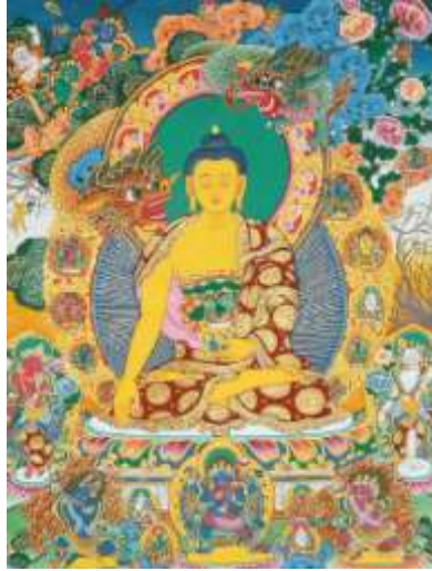
Sakyamuni and Mara

Maras, not very different in appearance from a naga and somewhere between the dragon and the snake is a mythical creature which the Pali dictionary introduces as "the personification of Death, the Evil One, the Tempter (the Buddhist counterpart of the Devil or Principle of Destruction)." The commentary further states that "The legends concerning Mara are ... very involved and defy any attempts at unraveling them." My reason for including Mara in this discussion is because metaphorically Mara belongs to the libidinal sea of desires and the dark deconstructive forces which find alliance with Satan leading Eve to the forbidden fruit. Maras also depict the negative Kundalini energy in our spine. While the meditative practices force the kundalini energy through the "sushumna" or the spine to uncoil and move upwards to spread its hood of enlightenment in "sahasara", the negative kundalini coils to wreck disease, lust, anger and negativity, as attributed to demoniac Mara.