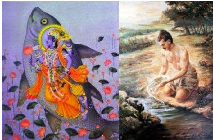
Story of Manu and Matsya Purana

Vedavyasa, the son of Satyavati and the sage Parashara besides composing the Mahabharata also composed the Mahapuranas. His real name was Krishna Dvaipayana. As he was dark in complexion, he was called "Krishna" and as he was born in an island, the sage acquired the name of Dvaipayana, where "dvipa" means an island. The Mahabharata has one lakh shlokas or couplets. After composing the Mahabharata, Vedavyasa composed the eighteen mahapuranas. The Matsya Purana is a medium-length Purana, and consists of fifteen thousand couplets. The longest Purana, the Skanda Purana , has eighty-one thousand. And the shortest Purana, the Markandeya Purana , has only nine thousand. The fourteen thousand shlokas of the Matsya Purana are divided into two hundred and ninety-one chapters (adhyaya). Usually Vishnu is regarded as having had nine incarnations, with the impending tenth one, Kalki, in the future.