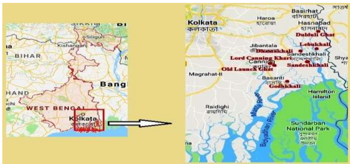
GPS map showing the sample collection spots