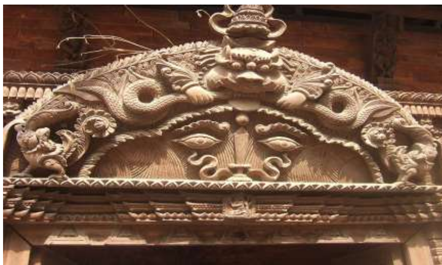
Kirtimukhi in Nepal

with Makara symbolism are curved knife, iron hook, vajra and the ritual dragon Makara. Makara is the symbolic representation of water and fertility and sometimes the architectural pattern is such that the Makara so sculpted also functions as a rain water spout or gargoyle. Generally, there are two identical makaras flanked by two nagas with the crown of garuda, upon the upper arches of carved wooden doorways of the "torana" that rises behind the enlightened throne of Buddha (Beer 2003:78). The iconography is called "Kirtimukha", and is very popular among the Newar craftsmen in Nepal. Kirtimukhi is the monster-mask which symbolizes the face of majesty, fame or glory.