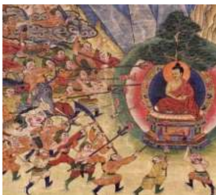
Temptations of Mara

Maras, not very different in appearance from a naga and somewhere between the dragon and the snake is a mythical creature which the Pali dictionary introduces as "the personification of Death, the Evil One, the Tempter (the Buddhist counterpart of the Devil or Principle of Destruction)." The commentary further states that "The legends concerning Mara are ... very involved and defy any attempts at unraveling them." My reason for including Mara in this discussion is because metaphorically Mara belongs to the libidinal sea of desires and the dark deconstructive forces which find alliance with Satan leading Eve to the forbidden fruit. Maras also depict the negative Kundalini energy in our spine. While the meditative practices force the kundalini energy through the "sushumna" or the spine to uncoil and move upwards to spread its hood of enlightenment in "sahasara", the negative kundalini coils to wreck disease, lust, anger and negativity, as attributed to demoniac Mara.