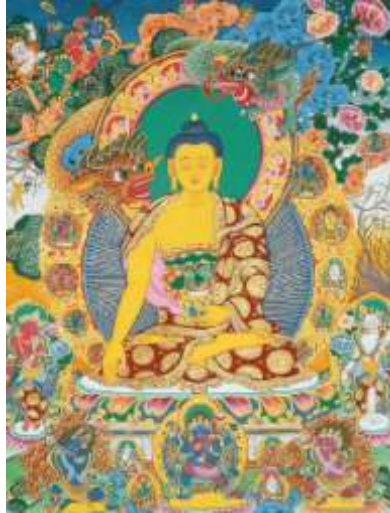
Sakyamuni and Mara

Maras, not very different in appearance from a naga and somewhere between the dragon and the snake is a mythical creature which the Pali dictionary introduces as "the personification of Death, the Evil One, the Tempter (the Buddhist counterpart of the Devil or Principle of Destruction)." The commentary further states that "The legends concerning Mara are ... very involved and defy any attempts at unraveling them." My reason for including Mara in this discussion is because metaphorically Mara belongs to the libidinal sea of desires and the dark deconstructive forces which find alliance with Satan leading Eve to the forbidden fruit. Maras also depict the negative Kundalini energy in our spine. While the meditative practices force the kundalini energy through the "sushumna" or the spine to uncoil and move upwards to spread its hood of enlightenment in "sahasara", the negative kundalini coils to wreck disease, lust, anger and negativity, as attributed to demoniac Mara.