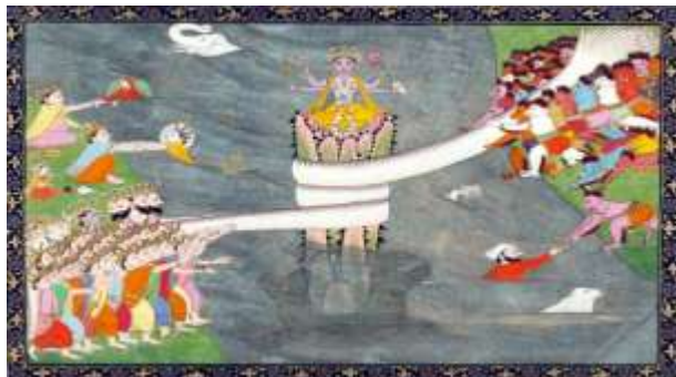
Churning of the Ocean of Milk with Vasuki

Mount Mandara and use him as their churning rope to extract the ambrosia of immortality from the ocean of milk.