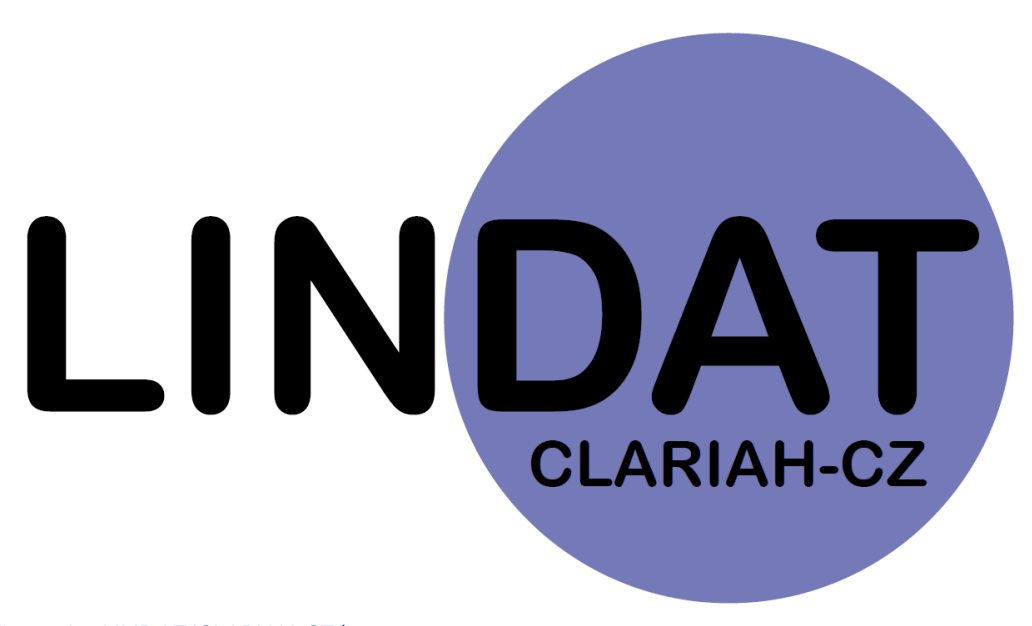
Figure 1 – LINDAT/CLARIAH-CZ logo