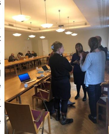
workshop "Reuse & sustainability: Open Science and social sciences and humanities research infrastructures"

Finnish National Board on Research Integrity. The total number Figure 2 - Photo from the of participants including speakers and organisers was 33. The workshop was very successful in raising awareness of the various issues that researchers and research infrastructures face