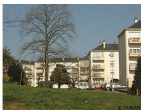
Fig. A14. Large block of flats