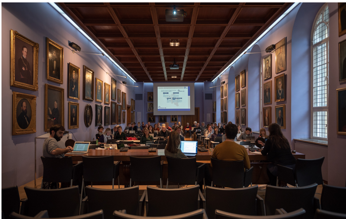
Figure 7 Rectorate of the University of Zagreb

Knowledge production is continuously changing and Research Infrastructures have a vital role in supporting research but they have to reinvent themselves. The DARIAH Strategic Plan for the next 7 years is an important step towards this direction. The work in DESIR was strategic in DARIAH's sustainability in order to measure the impact and excellence of DARIAH and how to increase trust. It represented a unique opportunity to engage transparently with the community. Work Package 6 used several sources to draw a set of recommendations. A survey addressed to users and potential users was launched in 2018 and individual interviews with policy makers and DH researchers have been collected in Germany, Croatia and Portugal. Furthermore, Work Package 6 members had the chance to exchange with DARIAH Bodies throughout the project. Data has then been processed analytically to suggest key strategic and mission-oriented recommendations: