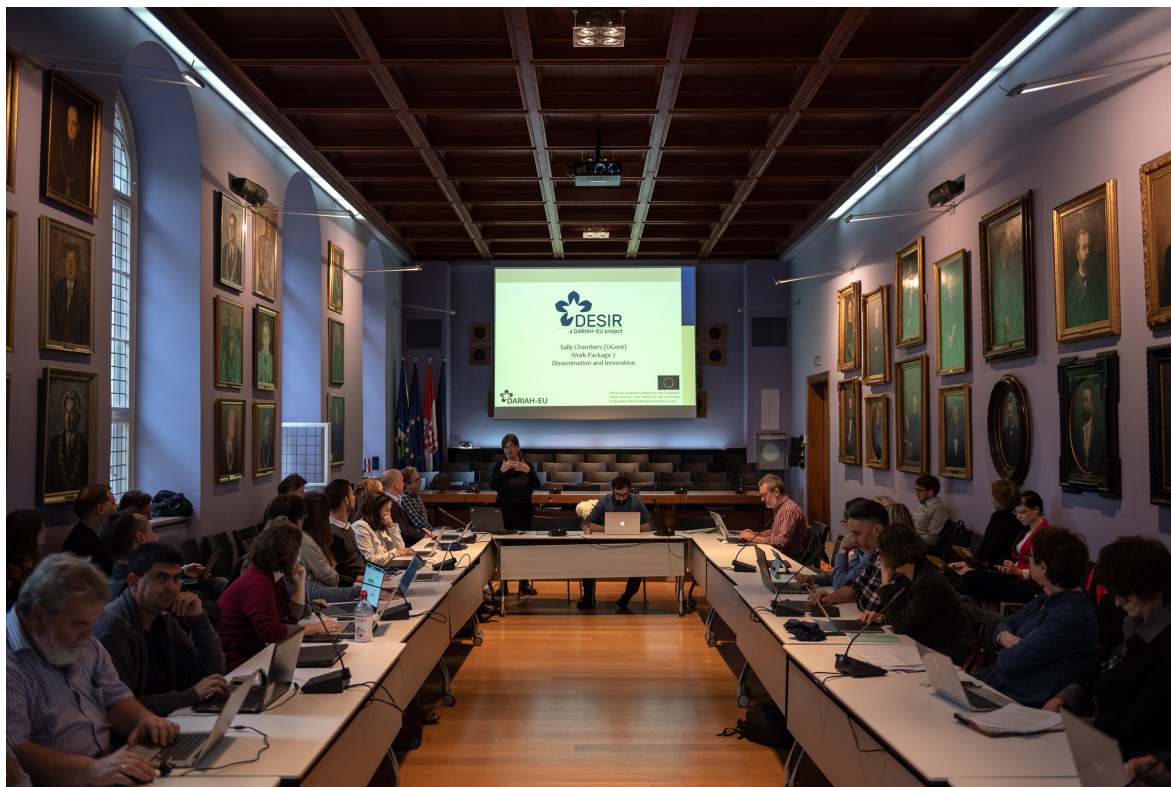
Figure 2 Sally Chambers presents Work Package 2

A research blog 6 to report on the DARIAH Beyond Europe workshops has been opened on hypotheses.org 7 , a platform that hosts several thousand blogs covering all areas of the humanities and social sciences. Individual pages were set up for each workshop with a description of the program, keynotes, registration and practical information. The blog also redirects to the community notes of each workshop, taken collaboratively by participants, and provides links to videos of the events.