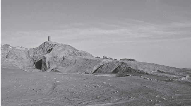
Fig. 3.4: Remains of the assault ramp at Europos-Dura, Syria, looking south (©MFSED).

available. Silva had at least 10,000 men at Masada – the Legio X Fretensis plus six cohorts of auxiliaries.