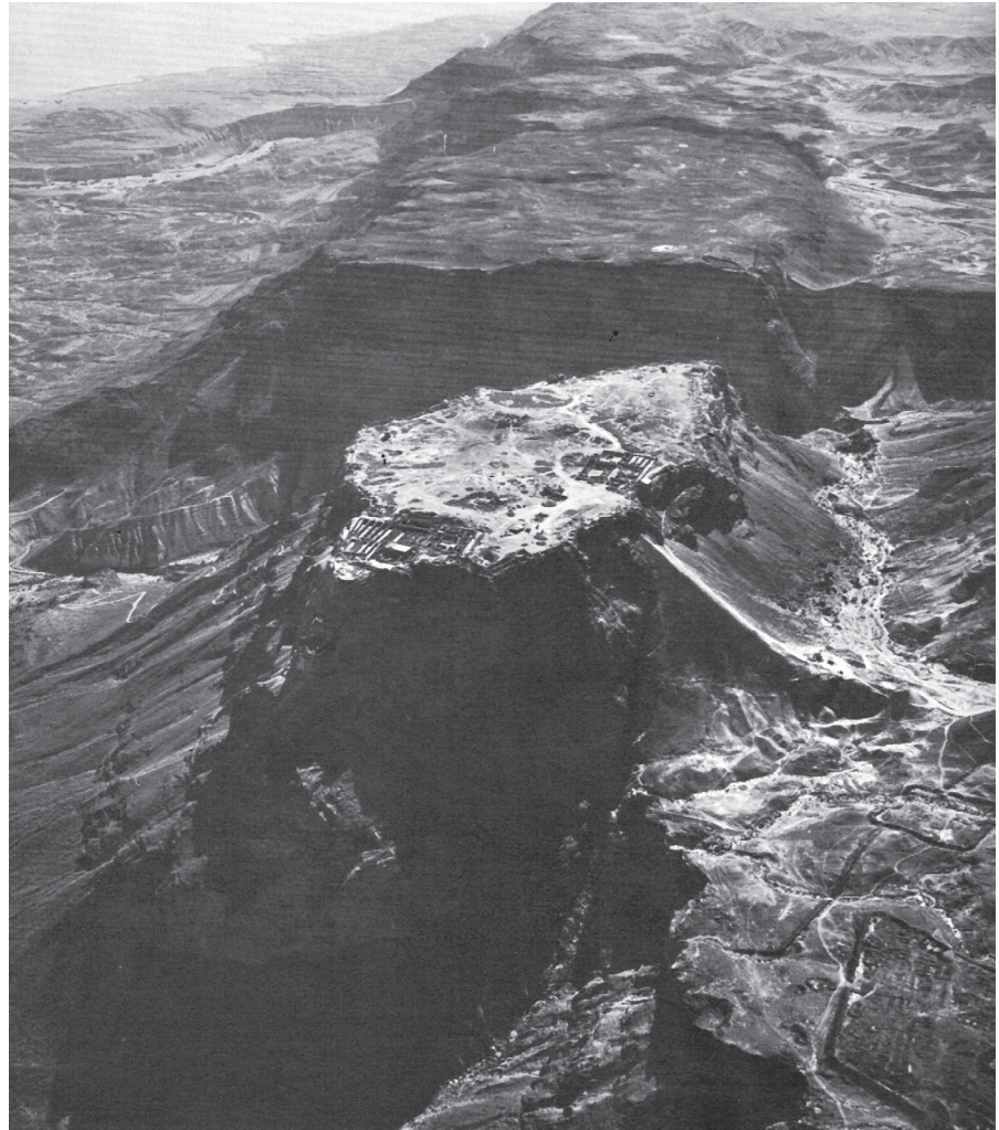
Fig. 3.3: The assault ramp at Masada, Israel (Yadin, 1966: 208).

At Masada, the agger was 210 m long and the difference in height between the base of the ramp and the top of the promontory was 100 m. Josephus says the Roman engineering work did not reach the top of the rocky promontory but stopped some 20 m below the casemate rampart. 10 As at Avaricum and Europos-Dura, the Masada assault ramp was not built against a gate but against the curtain wall of the rampart. It can be inferred that assault ramps were adapted specifically for attacking ramparts rather than gates. 11 To crown the top of his ramp, Silva