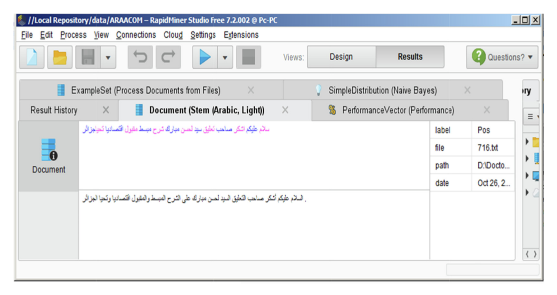
Fig. 1. Sample of word light stemming.

H. Rahab et al./Journal of King Saud University – Computer and Information Sciences xxx (xxxx) xxx