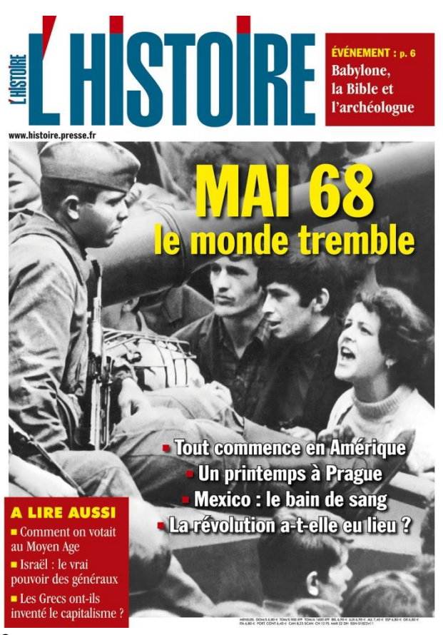
2 The main French mainstream history magazine

1968 saw at least nine million workers on strike for several weeks, often occupying their factories, offices, and schools. It was, at the time, the biggest general strike in history, and it counted four times as many strikers as the historic general strike of 1936 in France, long hailed as a major turning point in its gaining of the right to paid holidays.