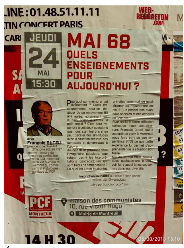
4 A Communist party meeting in 2018: What lessons from 1968?

lose. That the greatest superpower the world had ever known might be defeated by a poor peasant people: it felt that anything was possible now. In March 1968 in Poland in Eastern Europe, mass strikes had opposed the government and demonstrators chanted "Down with the Red bourgeoisie!". And in April 1968, when Martin Luther King was assassinated, riots broke out in all big US cities in protest. The Black Panther party, which had been founded in 1966 on a program of welfare activity and armed self-defence against the police, was gaining in popularity. Meanwhile, in April 1968, there had been huge demonstrations in Berlin after a radical student leader had been shot and severely injured by an anti-Communist right winger.