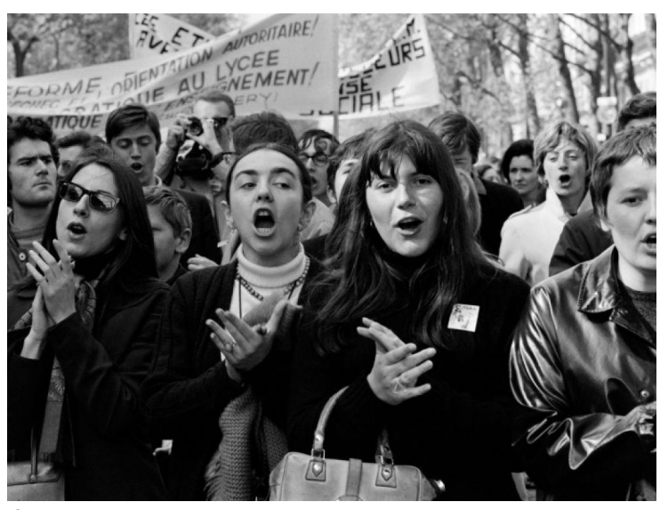
8 Student demonstrators 1968

De Gaulle was much damaged politically: the following April, he insisted on a referendum on constitutional reform, committing himself to resigning if he lost, which he did (by 53.2% to 46.8).