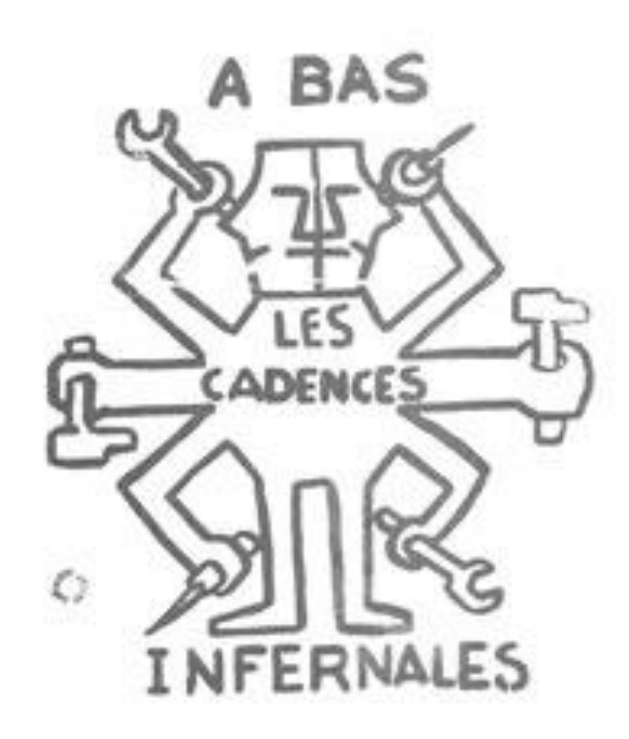
5 1968 poster: "Down with the hellish speed-up"

outside Paris at Billancourt, with 60 000 workers. Each group of workers had their own demands, but they were similar. In the Paris metro workers demanded a working week reduced to forty hours, and for two consecutive days off a week. In many workplaces, strikers kidnapped the bosses and kept them locked in their offices (even though the leadership of the CGT was opposed to this tactic). Trade union leaders were overtaken by the movement. The leader of the biggest union confederation, the CGT, declared that an unlimited general strike was not necessary, but he was not listened to.