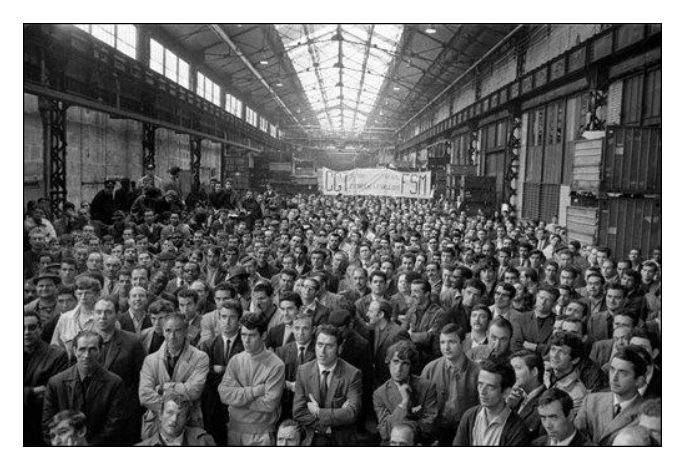
7 Factory meeting 1968

At this crucial point, the Communist party leadership agreed that legislative elections were the best way forward, and from then on, they would pull out all the stops to close down the strike movement. As June went on, the majority of public and private-sector workers returned to work, though there was much resistance. On the 6<sup>th</sup> June there were still two million men and women on strike. In clashes with the police at occupied factories, two people were killed.