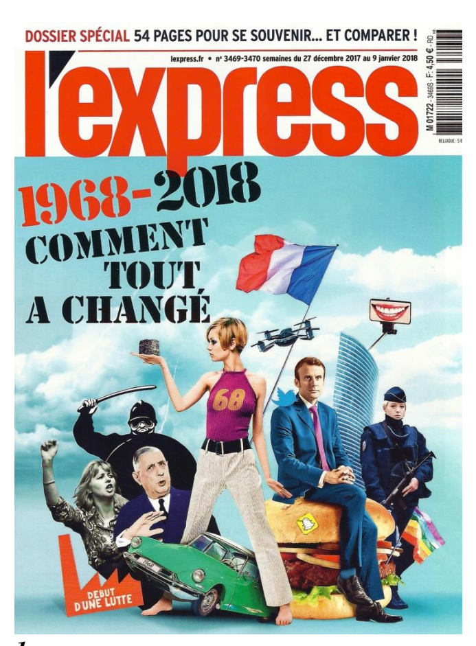
I Conservative magazine L'Express

It seemed, in France, in this year of 2018, that everyone was talking about 1968. A huge number of broadcasts, publications and commemorative events were being produced. The conservative magazine L'Express headlined "1968-2018: How Everything Changed". The National Archives and the National Library in Paris both held exhibitions on the theme, the latter on 1968 radical posters. Communist Party branches and different far-left organizations organized meetings or day schools on "May 68: What lessons for today?"