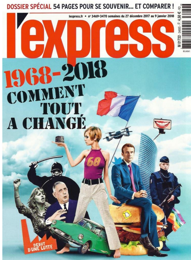
1 Conservative magazine L'Express

It seemed, in France, in this year of 2018, that everyone was talking about 1968. A huge number of broadcasts, publications and commemorative events were being produced. The conservative magazine L'Express headlined “1968-2018: How Everything Changed”. The National Archives and the National Library in Paris both held exhibitions on the theme, the latter on 1968 radical posters. Communist Party branches and different far-left organizations organized meetings or day schools on “May 68: What lessons for today?”