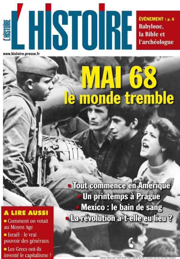
2 The main French mainstream history magazine

1968 saw at least nine million workers on strike for several weeks, often occupying their factories, offices, and schools. It was, at the time, the biggest general strike in history, and it counted four times as many strikers as the historic general strike of 1936 in France, long hailed as a major turning point in its gaining of the right to paid holidays.