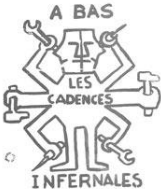
5 1968 poster: "Down with the hellish speed-up"

outside Paris at Billancourt, with 60 000 workers. Each group of workers had their own demands, but they were similar. In the Paris metro workers demanded a working week reduced to forty hours, and for two consecutive days off a week. In many workplaces, strikers kidnapped the bosses and kept them locked in their offices (even though the leadership of the CGT was opposed to this tactic). Trade union leaders were overtaken by the movement. The leader of the biggest union confederation, the CGT, declared that an unlimited general strike was not necessary, but he was not listened to.