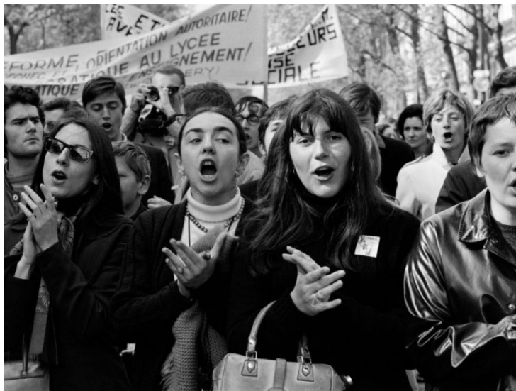
8 Student demonstrators 1968

De Gaulle was much damaged politically: the following April, he insisted on a referendum on constitutional reform, committing himself to resigning if he lost, which he did (by 53.2% to 46.8).