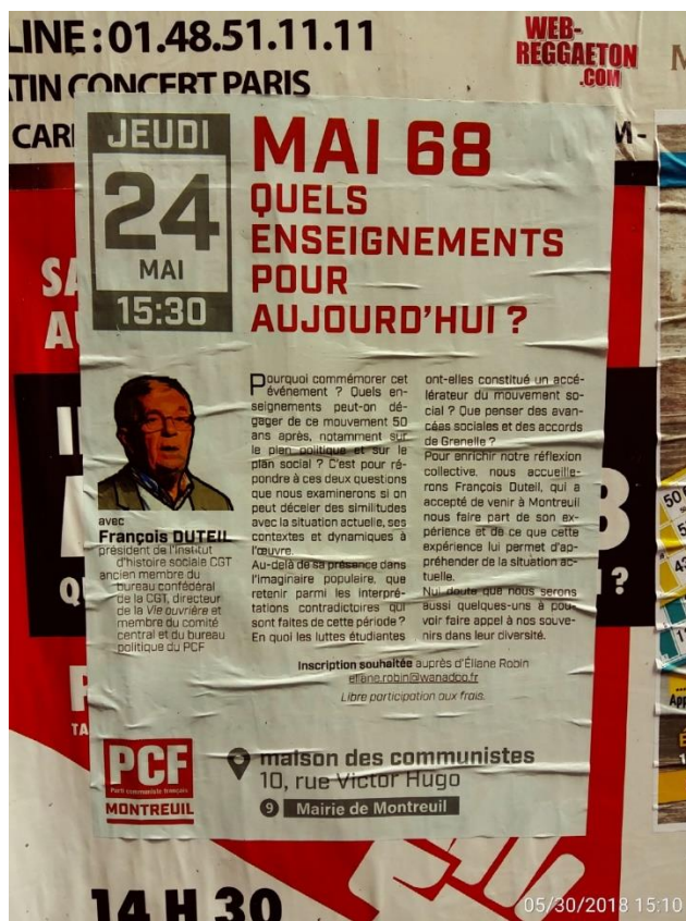
4 A Communist party meeting in 2018: What lessons from 1968?

lose. That the greatest superpower the world had ever known might be defeated by a poor peasant people: it felt that anything was possible now. In March 1968 in Poland in Eastern Europe, mass strikes had opposed the government and demonstrators chanted “Down with the Red bourgeoisie!”. And in April 1968, when Martin Luther King was assassinated, riots broke out in all big US cities in protest. The Black Panther party, which had been founded in 1966 on a program of welfare activity and armed self-defence against the police, was gaining in popularity. Meanwhile, in April 1968, there had been huge demonstrations in Berlin after a radical student leader had been shot and severely injured by an anti-Communist right winger.