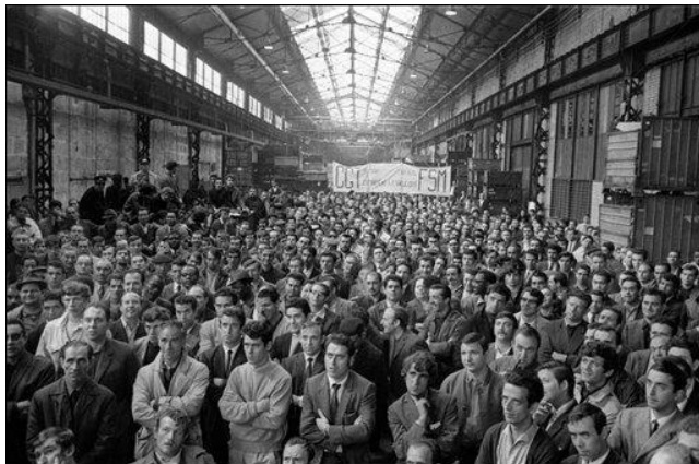
7 Factory meeting 1968

At this crucial point, the Communist party leadership agreed that legislative elections were the best way forward, and from then on, they would pull out all the stops to close down the strike movement. As June went on, the majority of public and private-sector workers returned to work, though there was much resistance. On the 6 th June there were still two million men and women on strike. In clashes with the police at occupied factories, two people were killed.