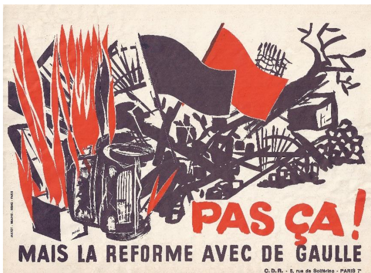
9 A pro-Gaullist poster from 1968

Why did De Gaulle panic? Heads of state with a long experience in politics do not usually show panic, either because they find the self-control necessary or because they have surrounded themselves with trusted advisers who stabilize them (although the new US president is extending the range of emotional expression one can expect from a head of state). The elite has learned lessons since 1968. Governments are less naive; certainly one cannot imagine national leaders leaving the country on official visits abroad during insurgent movements of this type, as both De Gaulle and Pompidou did in 1968. And today's police are more sophisticated in weaponry and tactics.