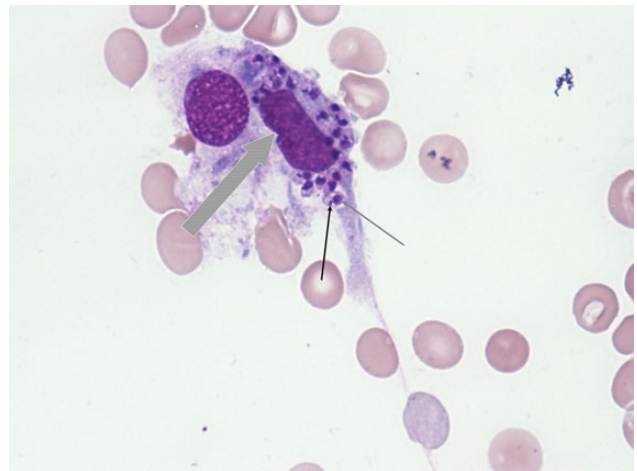
Figure 2. Smear of bone marrow aspirate (May-Grünwald-Giemsa, magnification \times 1000 ). This image shows intracellular amastigotes, although most parasites are generally observed free between mononuclear cells. The nucleus of the parasitized histiocyte is indicated by the large gray arrow. Amastigotes were unambiguously identified by the association of their rod-shaped kinetoplast (thin black arrow) and single nucleus (thin gray arrow).

Diagnosis: Visceral leishmaniasis in a liver transplant recipient.