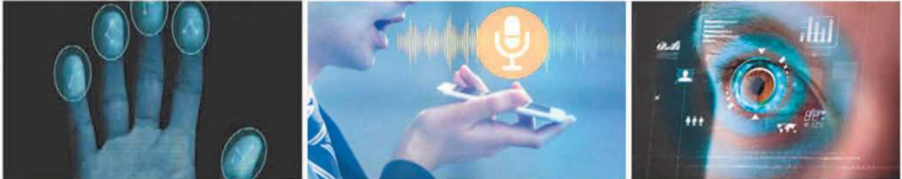
Figure 2: Biometrics data.

Many systems (sensors and applications) used for recognition, authentication and identification (Figure 2) are deployed on devices (e. g. smartphones) that are commonly used nowadays. Collecting data generated by these systems and integrating them with video-surveillance data can be helpful in an investigation. Let us remember that "Biometric data = Personal data".