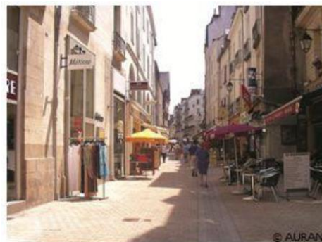
Fig. A16. City-center flat