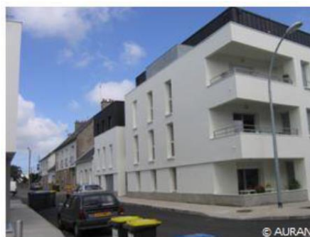
Fig. A12. Small block of flats