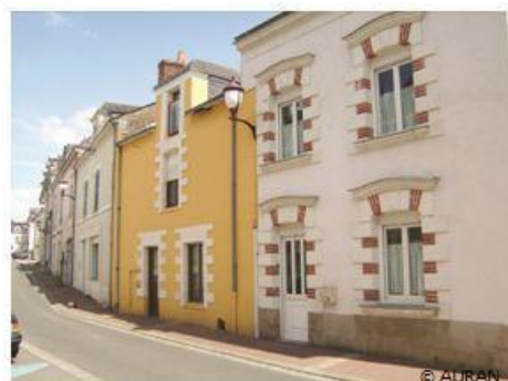
Fig. A15. City-center house