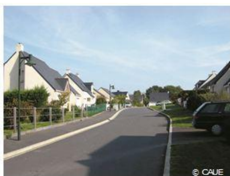
Fig. A13. Housing estate