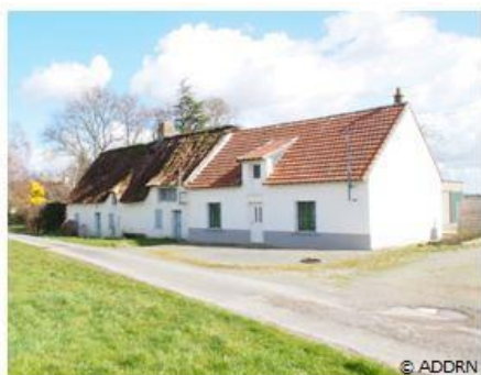
Fig. A11. Isolated individual house