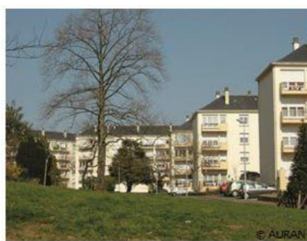
Fig. A14. Large block of flats