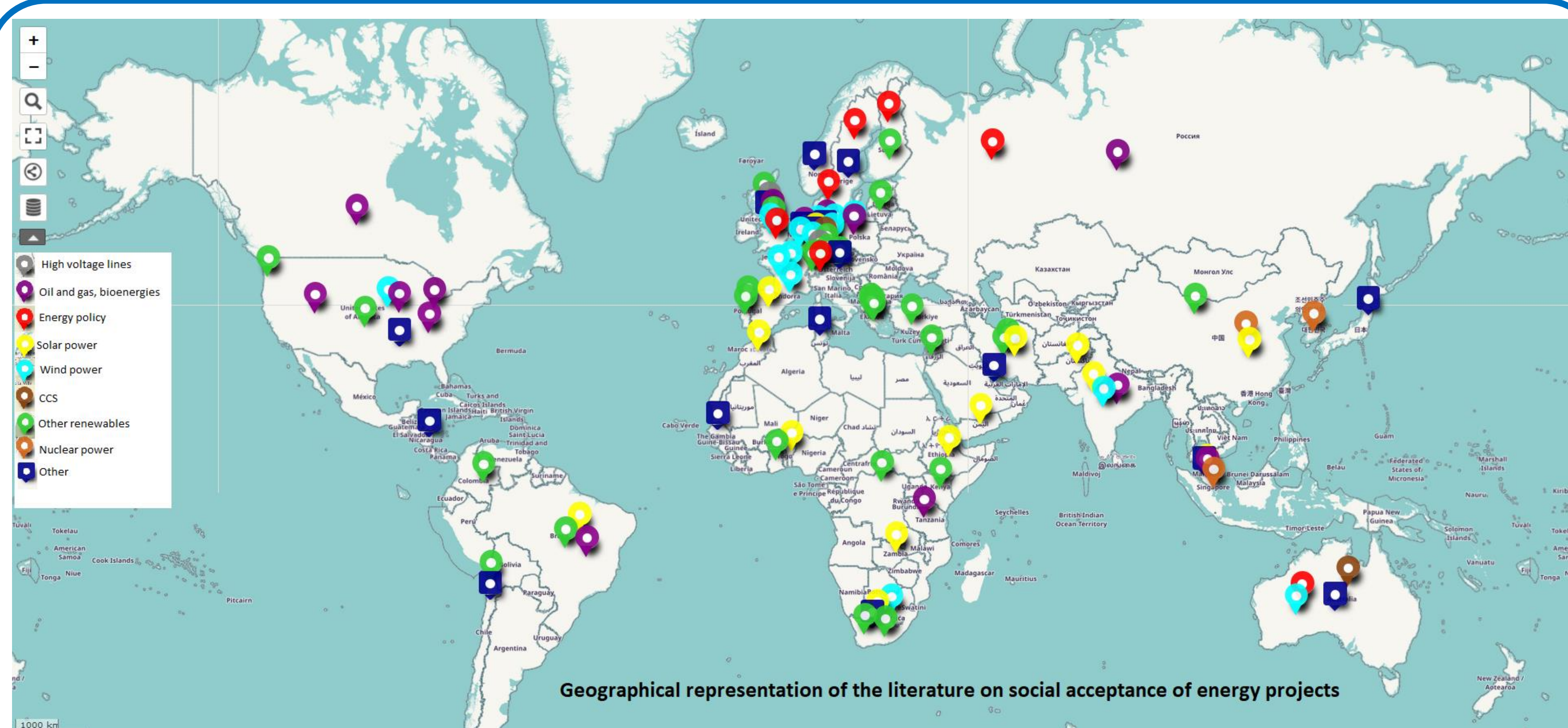
Social acceptance of energy projects: A geographical focus based on literature (based on the analysis of 96 papers)