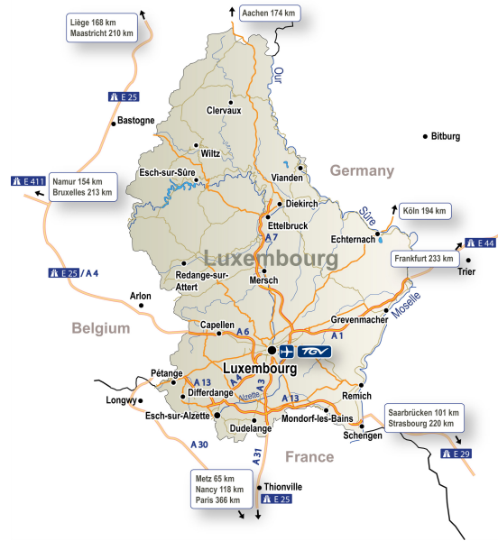
Figure 1: The map of the route network in Luxembourg. [5]

materials, "Corrosive substances", "Miscellaneous" [28]. The DG present a high risk during the transportation process. The challenge originates from the fact that the accidents of anywhere a subject are DG have catastrophically consequence [29]. The significant percentage of TDG is performed every day [27]. A notable presence in transportation statistics is allocated for the TDG, and the transportation network comprises a large number of DG daily [13]. The governance of this process is subject of predefined national and international regulation which determine a sustainable process for TDG. These regulations intend of minimizing the risk by standardizing the process of TDG [17]. The research from [28] elaborates the procedures for packing, labeling, loading, transporting, unloading and warehousing of dangerous goods.