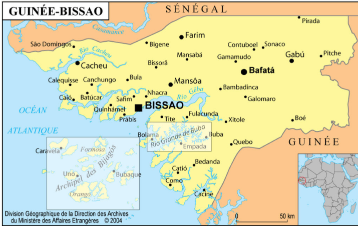
Figure 6. doi

in the west central region of Guinea-Bissau, between 11.4° and 11.7° North and 15° and 15.5° West. It flows into the Atlantic Ocean in front of the Bijagos Archipelago (Fig. 6).