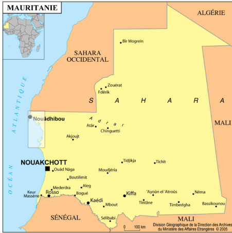
Figure 9. doi

Map of Mauritania showing the location of the Banc d'Arguin National Park (box).