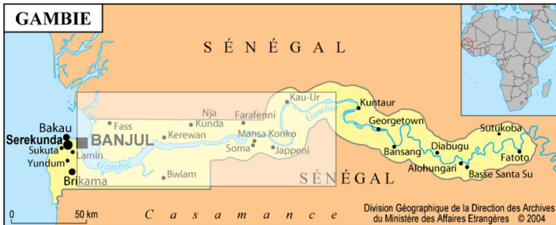
Figure 7. doi

A joint IRD/Gambian Fisheries Department research programme was conducted from 2001 to 2003, for the “Evaluation of the fish resources and estuarine resources stewardship of the Gambia River”. It was funded by the French Department for Cultural Action and Cooperation (SCAC). The study area comprised the lower, middle and upper estuary, from Banjul at the mouth to Deer Island 220 km upstream (Fig. 7). The Gambia estuary is located between 13.2° and 13.7° North and 15° and 16.6° West. In this region, the wet season extends from June to October, with peak rainfall in August. The cool dry season lasts from November to March and the warm dry season from April to June.