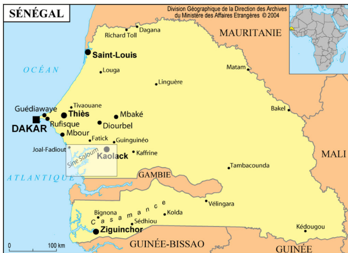
Figure 4. doi

with a 25 mm mesh) were conducted in April, June and September 1990. In December 1990, a few trials were conducted using a “truncated” beach seine and a 100 m long purse seine. From April 1991 to May 1993, a standardised sampling protocol was used with a purse seine 250 m long, 18 m deep with a 14 mm mesh size. Ten sampling sites were defined covering the eight zones of the Sine Saloum delta. On each sampling occasion, each site was sampled twice, one haul in the middle of the channel and the other near the bank, to obtain a representative picture of the diverse habitats. All the sites were sampled at two or three monthly intervals, except the two sites in zone Z8, upstream of the Saloum, which were sampled only twice: once during the wet season (October 1992) and once during the dry season (February 1993). A few “off-protocol” surveys were also done, using the same purse seine, but without following the standardised protocol. Surveys carried out in July, August and September 1994 only covered small “bolongs” fish assemblages. Finally, a last survey was carried out in January 1997 following the standardised protocol.