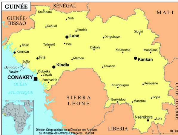
Figure 5. doi

month, to obtain a comprehensive description of fish assemblage variability. The purse seine (250 m long, 18 m deep with a 14 mm mesh size) was used every two months from January 1993 to January 1994, at eight equidistant sites, one of which was located in the ocean in front of the river mouth. Each site was sampled during daylight, each time with two hauls, one haul in the mid-channel and the other as near as possible to the bank (minimum water level: 2 m). The gillnets were set up in parallel and close to the bank, in order to provide a better sampling of riparian fish assemblages. A gillnet set was composed of ten panels of different mesh size (10, 12.5, 15, 17.5, 20, 22.5, 25, 30, 35 and 40 mm). Each panel was 25 m long and 2 m deep. Four sampling sites, the same as those used for the purse seine samplings, were located 3, 17, 33 and 46 km from the mouth, respectively. At each site, four “stations” were defined, corresponding to two subsequent nights on both sides of the estuary. In the Dangara inlet, three sites were defined. Dangara surveys took place immediately before or after those in the Fatale estuary, i.e. every two months. Only purse seine samplings were performed, twice at each site as in the Fatale estuary (mid-channel and close to the bank).