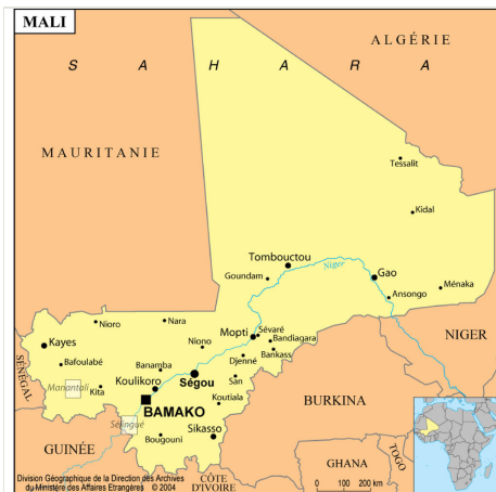
Figure 8. doi

In 2002 and 2003, a comparative study was conducted by the RAP research unit of IRD in Mali, to better understand the impact of fishing effort on fish assemblages. This study was funded by the Priority Solidarity Fund ( Fonds de Solidarité Prioritaire - FSP), part of the French Ministry of Foreign Affairs. The Manantali and Sélingué man-made reservoirs (Fig. 8) were selected because of their similar size and edaphic and environmental properties, but subject to different degrees of fishing pressure: low at Manantali vs. high at Sélingué (Kantoussan 2007). Manantali is located between 12.9° and 13.3° North and 10.2° and 10.4° West and Sélingué is located between 11.2° and 11.6° North and 8° and 8.4° West. Three methods of assessment were combined for this study: fish gillnet sampling, surveys of artisanal fisheries and hydroacoustics (Coll et al. 2007).