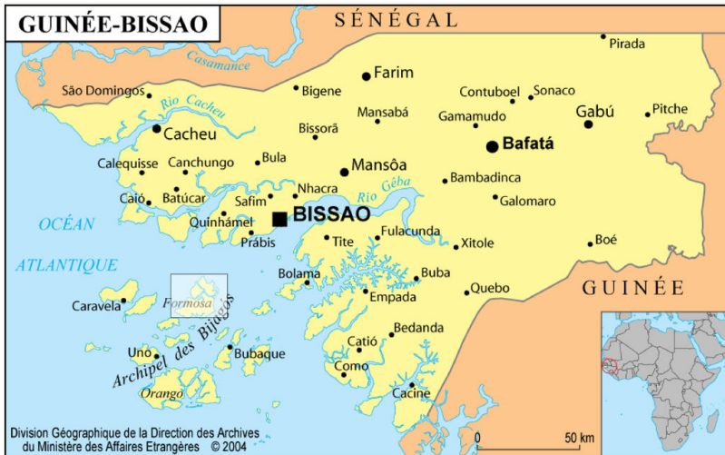
Figure 10. doi

Map of Guinea-Bissau showing the location of the Urok Island MPA (box).