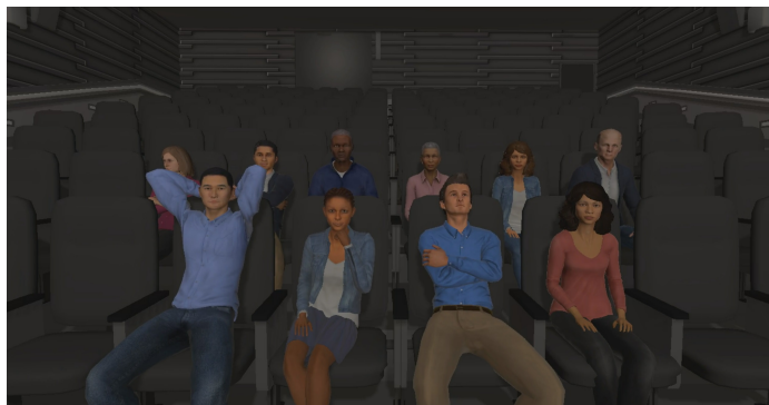
Fig. 1: Screenshot of the Cicero virtual audience.

In previous work, we introduced the Cicero virtual audience framework [6]. The architecture of the system is presented in Figure 2. Our primary goal for this system was to study public speaking training. In a preliminary experiment to validate the potential of virtual audiences, we designed a behavioral reinforcement training scenario where the user would train one specific behavior at a time, and the virtual audience would produce feedback on this particular behavior. For example, one training scenario would be designed to help participants avoid pause fillers ( i.e. hesitation words such as hmm or err ): when the participants produced a pause filler, some audience members would start to shake their head in disagreement. Conversely, if the participants did not utter any pause filler during a certain duration, the audience members would nod. The main idea behind this training paradigm would be that positive feedback would reinforce the users' tendencies to produce appropriate behaviors, whereas negative behaviors would inhibit them from producing them unwanted behaviors. The experiment produced positive results as we found the virtual audience system not only improved the participants' performance as evaluated by public speaking experts, but also fostered high engagement by participants, which presumably improves the likelihood of participants to sustain training with the system for prolonged periods of time.