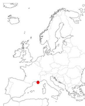
Figure 2. Presentation of the Camargue region and the use of the local equine breeds in this area.

In southern France, near the Mediterranean Sea, a regional park and nature reserve named “Camargue” houses particular flora and fauna adapted to saline conditions. This reserve is composed of marshes and wetlands of the Rhône Delta, spanning 150,000 hectares. Camargue horses live in semi-feral conditions in this area and are ridden by guardians/traditional breeders who raise Camargue bulls used in bullfighting. This traditional work is seen as a part of cultural heritage and is promoted during cultural events. This equine breed is also used in equestrian tourism to explore the Camargue region.