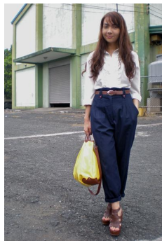
(a) Original image

Recently, convolutional networks have started to achieve good performance in recognition and have also been deployed for semantic segmentation. For example, the fully convolutional network introduced in [27] improved the performance on the Pascal VOC database by using convolutional layers for pixel prediction and deconvolution layers for upsampling the result. DeepLab [22] improved on this by integrating a Markov Random Field into the upsampled network. In [39], conditional random fields were formulated as Recurrent Neural Networks and achieved good results on most classes of Pascal VOC [10]. Meanwhile, convolutional networks have also been used in fashion retrieval. Hadi et al. [17] employ three methods for street-to-shop retrieval, including two deep learning methods, and a deep similarity learning for the street and shop domains. In [34], the style retrieval uses Siamese CNN to transform features into a latent space. To achieve fast retrieval in a large scale dataset, [23] devised hashes-like representations learned by a latent layer added to the network during fine-tuning on the clothing dataset. Another emerging topic is fashionability : predict how fashionable a person looks. A conditional random field model that reasons about several fashionability factors by using deep network features was put forward in [32].