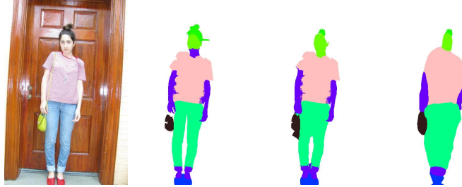
Fig. 4. Comparison with FCN: original image (first), ground truth (second), our method (third) and FCN (last).

A visual comparison with the results of the FCN is also shown in Fig. 4. As hinted by the quantitative results, the FCN leads to an excessive smoothing and the segmented clothes include larger parts of external objects. This occurs on most of the images in the database, explaining the lower performance of FCN in Table 1 and Table 2.