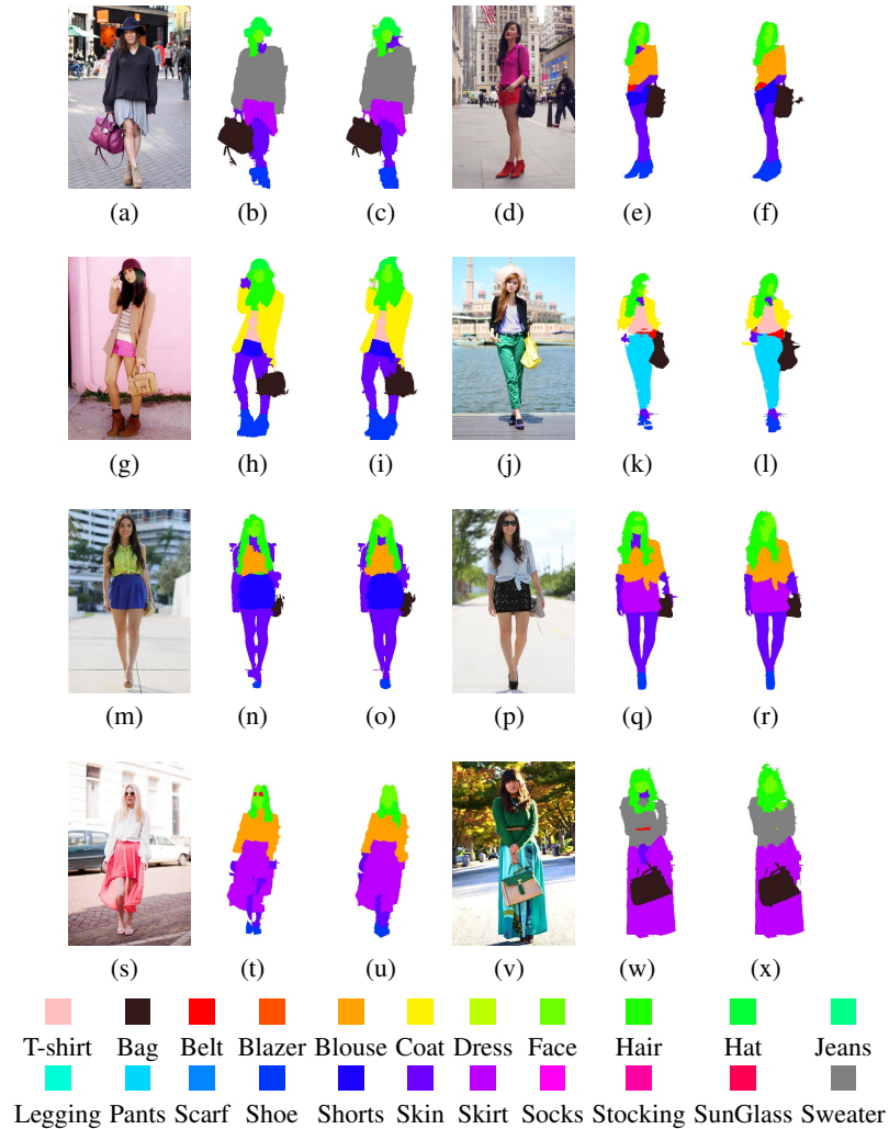
Fig. 3. Qualitative evaluation: original images (a, d, g, j, m, p, s, v), ground truth (b,e, h, k, n, q, t, w) and associated segmentation results (c, f, i, l, o, r, u, x).

Qualitative evaluation. In Fig. 3 we present some difficult but quite successful segmentations: (a, d) for clothes against confusing or cluttered background, (g, j) for deformed clothes (opened jacket) and (m, p) for small object extraction (shoes). Some parts of our results show that the ground truth is not perfect and an automatic segmentation method can do better. Fig. 3 also shows examples where the proposed method is not perfect: when comparing to the ground truth, in (s) it failed to detect the sunglasses and in (v) it failed to detect the belt and the skin (neck). This reflects the lower F_1 score in Table 2 for sunglasses and belt. Small objects are quite difficult to extract and may require a specific setting, including e.g. a higher penalty during training.