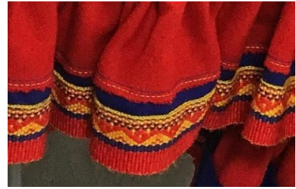
Figure 2c. Holbi from Unjárga

students managed to recognize and name here. The students' discussions lead to a common rule for what counts as a hearva ; it has to be a system of colours. When asked to search for repetitions, everyone found something; for example red-green-red-green ... , square-rectangle-square-rectangle ... and star-candle-leaf-star-candle-leaf... After a while, one student pointed at two fabrics, claiming that one has hearva while the other has not. This student distinguished between what is hearva and what is not by a counterexample; that something is not hearva .