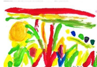
Figure 3. Three painted hearvvat