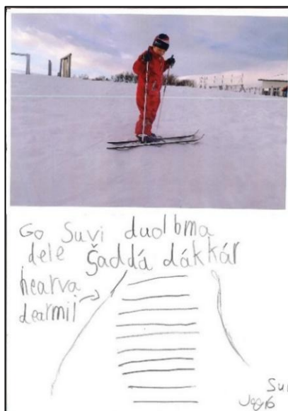
Figure 4b. Duolbmá