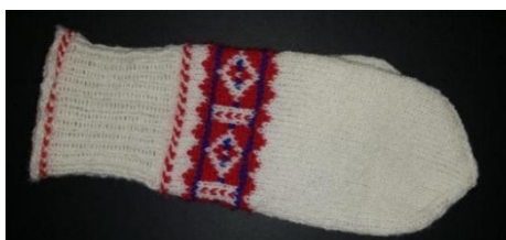
Figure 1. Example of hearvafáhcca : The patterned Unjárgga/Nesseby glove

or template, and girje , which has two meanings. Girje means a spot of another colour (on an animal). In plural form, it means coloured ornamental patterns, like girjefáhccat ; gloves that are patterned all over. However, the word girje 's second meaning is book . According to a more recent dictionary (Kåven, Jernsletten, Nordahl, Eira & Solbakk, 1995), hearva means decoration, trimming, or embroidery, while minsttar means pattern or formula, and girji means book, letter, or spot. So, in total there are three different North Sámi words that can mean pattern in English. The North Sámi version of the mathematics curriculum (Ministry of Education and Research, 2013) consequently uses minsttar for pattern (Norwegian: mønster). Minsttar may work for number patterns, but not for the geometrical patterns in the teaching unit. Lisbet uses the word hearva in the teaching unit. She discussed the question of using minsttar or hearva with Harald Gaski who is a professor in Sámi culture and literature. He too found hearva to be more appropriate for pattern in the teaching unit's contexts. Gaski (1998) describes the lyrics in the traditional Sámi song, luohti , as something that follows a pattern. In that context, he uses the Sámi word girji for pattern. Pattern is a central concept in mathematics, but the literature has not problematized the Sámi translations of it.