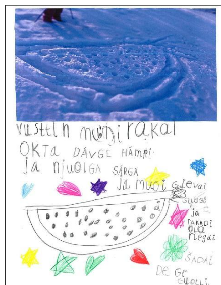
Figure 4c. Guolli

Step 4 took place at the school's soccer field. The students were asked to create their own hearva in the snow. They explained their hearvvat to the others, and Lisbet captured photos of their work. Usually, the students use Norwegian skiing concepts when they speak Sámi, but now they have started using Sámi concepts like spiehččut (herringbone skiing) as shown in Figure 4a, and duolbmat (sideways uphill tramping) as shown in Figure 4b. When you perform skiing techniques like in Figure 4a and 4b, the outcomes are patterns in the snow. These patterns are named by the