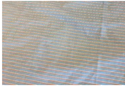
Figure 2b. Stripes