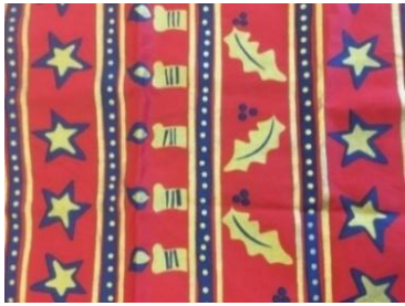
Figure 2a. Stars and candles