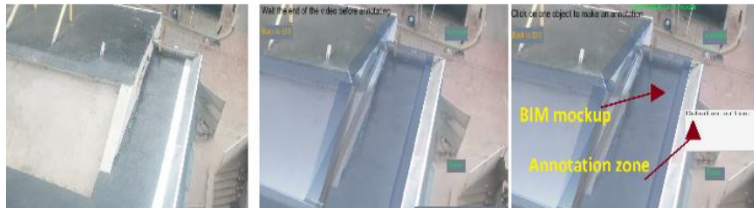
Fig. 3. From left to right: a) video of the building from a drone, b) MR visualisation: superimposition of the video and the BIM model c) MR interaction: annotations [20]

Our second case study [20] focused on improving construction supervision, which is necessary to ensure planning enforcement, by allowing off-site supervision and comparisons between as-built (from drone videos) and as-planned design (from BIM models). Thanks to superimposition in MR (Figure 3, b) and c)), inspectors could estimate differences to make their report and enrich the BIM model.