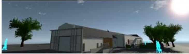
Fig. 2. Architecture design of the nursery in our virtual reality application [19]

Our first case study (Figure 2) was about a nursery construction project, where the architect and future final users wanted to review the architectural design according to the future usages (WHY). If we would have used task abstraction and decomposition, we would have had as subtasks: navigate in architectural model, check light exposition, confirm design, and check building usability for future operation. In this study [19], we wrote a previous version of our methodology, wondering which BIM data would be useful, how it should be shown, and how to perform in this environment. The data (WHAT) used were sun simulations and the architectural BIM model, interactions (HOW) were navigation by teleportation, and visualisation was realistic (shadows). However, some interactions were missing (annotate), and measures were not taken neither to compare performance (time, number of annotations), nor for improving our methodology.