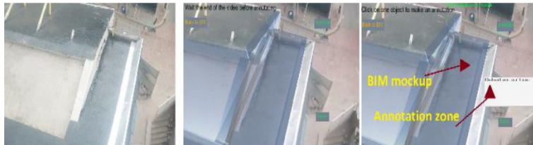
Fig. 3. From left to right: a) video of the building from a drone, b) MR visualisation: superimposition of the video and the BIM model c) MR interaction: annotations [20]

Our second case study [20] focused on improving construction supervision, which is necessary to ensure planning enforcement, by allowing off-site supervision and comparisons between as-built (from drone videos) and as-planned design (from BIM models). Thanks to superimposition in MR (Figure 3, b) and c)), inspectors could estimate differences to make their report and enrich the BIM model.