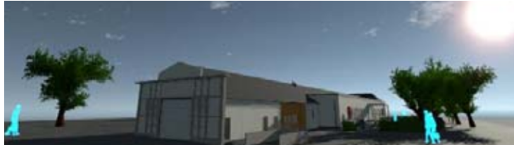
Fig. 2. Architecture design of the nursery in our virtual reality application [19]

Our first case study (Figure 2) was about a nursery construction project, where the architect and future final users wanted to review the architectural design according to the future usages (WHY). If we would have used task abstraction and decomposition, we would have had as subtasks: navigate in architectural model, check light exposition, confirm design, and check building usability for future operation. In this study [19], we wrote a previous version of our methodology, wondering which BIM data would be useful, how it should be shown, and how to perform in this environment. The data (WHAT) used were sun simulations and the architectural BIM model, interactions (HOW) were navigation by teleportation, and visualisation was realistic (shadows). However, some interactions were missing (annotate), and measures were not taken neither to compare performance (time, number of annotations), nor for improving our methodology.