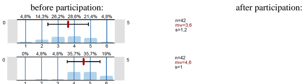
Figure 2: Results of item 2 (paired sample: p-value <0,001; d = 1,001214; effect size high)

Exemplary item 2: I can adapt instruments for the diagnostically founded support of mathematical competences (e. g. four-phases model) to plan my lessons for the inclusive mathematics classroom.