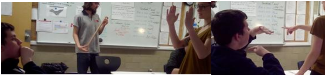
Figure 2: Teacher and student's gestures to model and appropriate measurement

The teacher addresses the student's questions, but procedural help is suggested by the new questions that she raises - she helps the student to organize the steps for developing his plan without giving him the answers. The student, in turn, adapts in a flow of interactions by trying to answer her questions. When he experiences difficulty formulating his answers, the teacher proposes compensatory help, in this case, modeling the incidence relation between the floor and the wall with the help of material. At the language level, the teacher models the measurements with the help of gestures that the student will repeat afterwards in order to appropriate them (Figure 2).