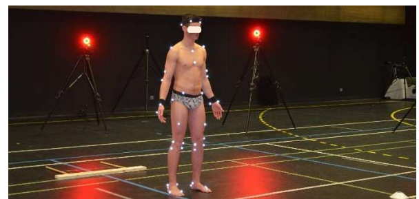
Figure 1 Experimental set up

and to left side. To do this, the participant had to bend his knee allowing the pelvis to tilt to the same side. The test was explained to the participants and repeated several times before the recordings (Figure 1). After a static trial, participants were instructed to perform the right and left one-sided tilt test in an alternate sequence.